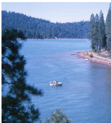
Boating in Shasta Reservoir

The Mid-Pacific Region currently employs about 1000 people in a wide range of positions from park ranger to engineer to administrative assistant to fishery biologist. Project managers take the lead in negotiating contracts, implementing habitat improvements and furthering ongoing projects. Operations and maintenance personnel manage and maintain critical facilities in drought and flood conditions, monitor facilities instrumentation, perform preventive maintenance and oversee rehabilitation and repair projects. Support staff provides the design, engineering, construction, data processing, human resources, procurement, budget, and other services essential to getting the job done.