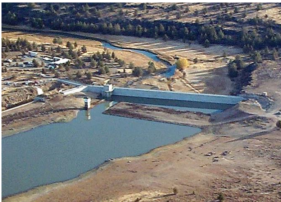
Clear Lake Dam and Reservoir

The irrigable lands of the Project are in South-Central Oregon (62 percent) and North-Central California (38 percent). The Project delivers water to approximately 210,000 acres of cropland. There are two main sources of supply water for the project: Upper Klamath Lake and the Klamath River on the West Side and Clear Lake Reservoir, Gerber Reservoir, and Lost River on the East Side, which are located in a closed basin.