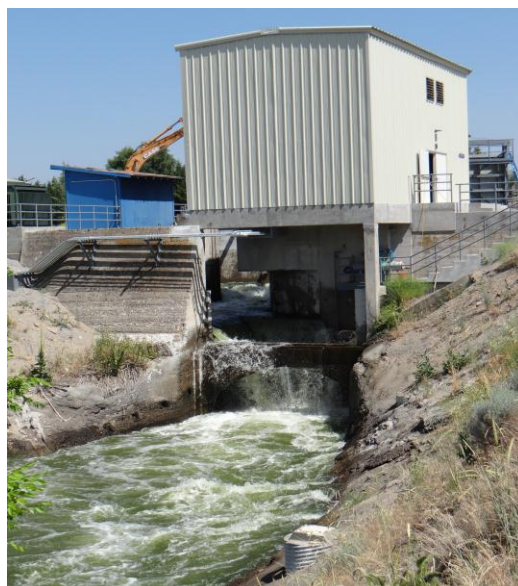
The C-Drop hydroelectric facility

Completed in 2012, the C-Drop hydroelectric facility uses the force of water dropping 22 feet from the A Canal to the C Canal to generate up to 1.1 megawatts. The facility does not change diversions or timing of irrigation flows and doesn't impact fish or wildlife.