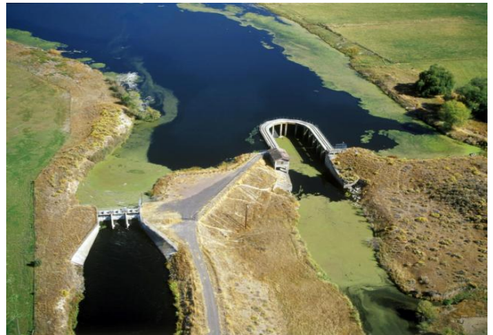
Lost River Diversion Dam is on Lost River about 4 miles below Olene, Oregon.

Lost River Diversion Dam is on Lost River about four miles south of Olene, Oregon. The dam diverts excess water from the Lost River to the Klamath River through the Lost River Diversion Channel. This dam acts in conjunction with Clear Lake and Gerber Dams to reduce flows into the reclaimed portions of Tule Lake and the restricted Tule Lake Sumps in the Tulelake National Wildlife Refuge. It is a horseshoe shaped multiple-arch concrete structure with earth embankment wings.