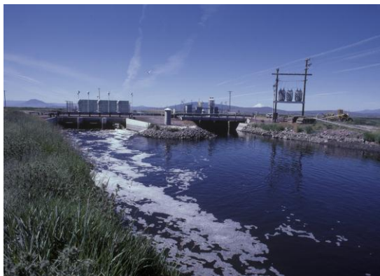
Pumping plant E and EE on the Klamath Straits Drain.

There are 19 canals that total 185 miles and have diversion capacities ranging from 35 to 1,150 cubic feet per second (cfs). Laterals total 490 miles and drains 545 miles.