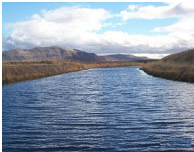
Klamath Straits Drain