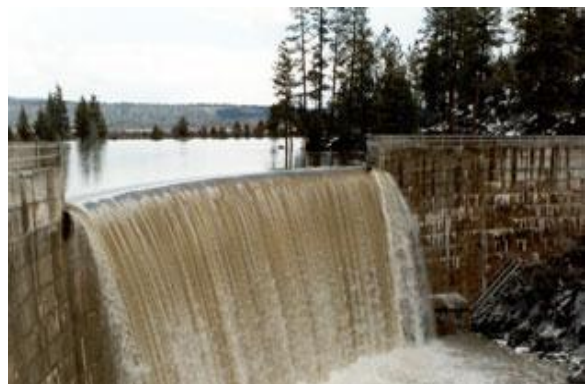
The Gerber Dam and Reservoir

Gerber Dam and Reservoir, on Miller Creek, 14 miles east of Bonanza, Oregon, provide storage for irrigation and reduces flow into the reclaimed portions of Tule Lake and the restricted Tule Lake Sumps in the Tulelake National Wildlife Refuge. The dam is a concrete arch structure, and the reservoir capacity is 94,300 acre-feet.