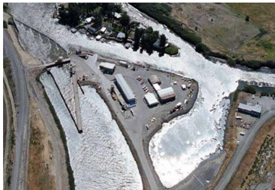
Tracy Fish Collection Facility

The Tracy Fish Collection Facility is a complex system of louvers, bypasses and holding tanks operated to protect and salvage fish, natural to the area, from the nearby C.W. “Bill” Jones Pumping Plant. The facility collects Sacramento-San Joaquin Delta fish species as a primary mitigation feature for the pumping plant and returns them to the Delta.