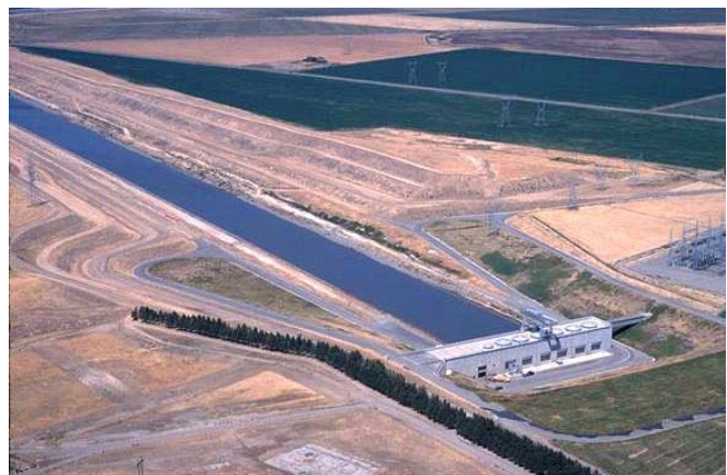
Sacramento - San Joaquin Delta