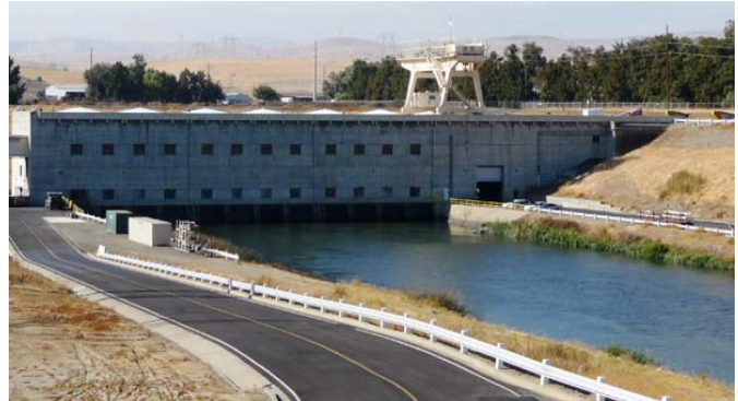
C.W. "Bill" Jones Pumping Plant

The plant is located near the Tracy Fish Collection Facility, which diverts threatened and endangered fish away from the pumps to meet regulatory requirements. As long as the fish facility is in operation, the pumps can operate.