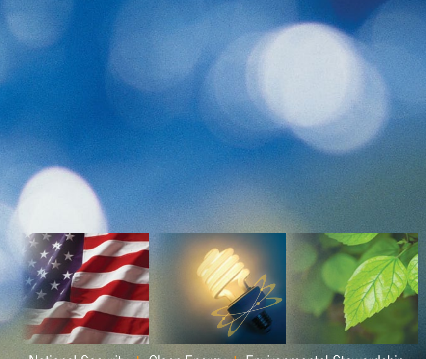
National Security | Clean Energy | Environmental Stewardship

Thank you for your attention to our "point of entry" safety and security briefing. With your help, the Savannah River Site will continue to be an injury-free and accident-free workplace.