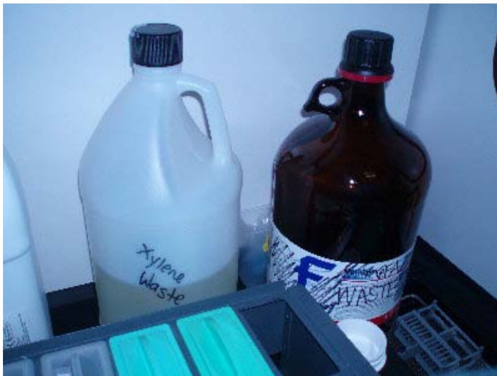
Photo 17: incompletely labeled containers identified as “xylene waste” and “FA waste” in the McMahon Lab.

The inspectors noted that a 1-gallon container identified as “xylene waste” and a 1-gallon container identified as “FA waste” were insufficiently labeled (Photo 17).