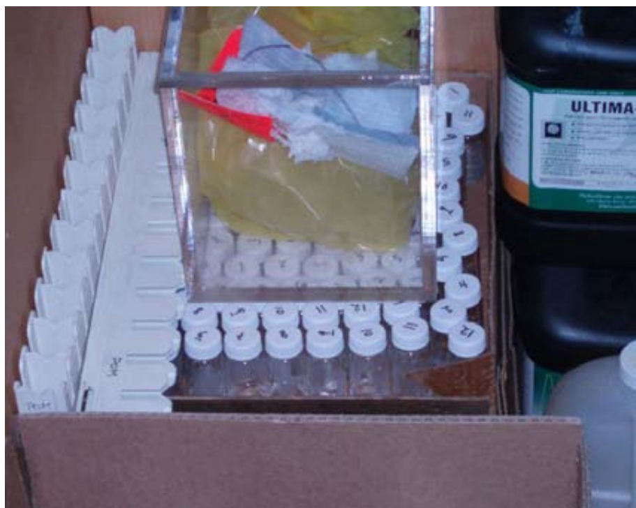
Photo 4: unlabeled, discarded scintillation vials still containing scintillation liquid