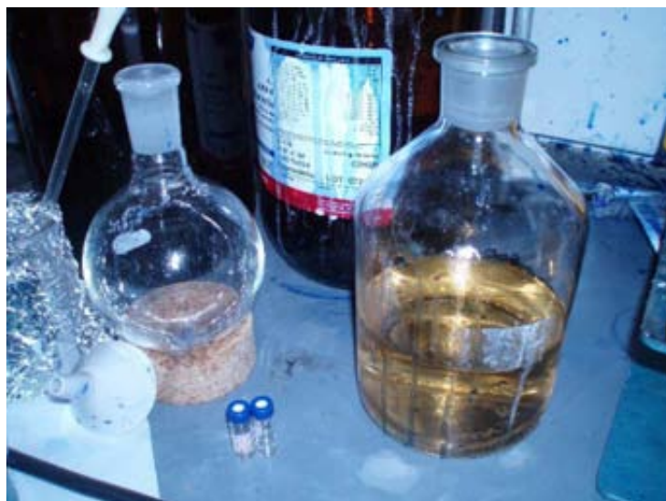
Photo 2: open, unlabeled, unidentified container of yellow/brown liquid under lab's fume hood