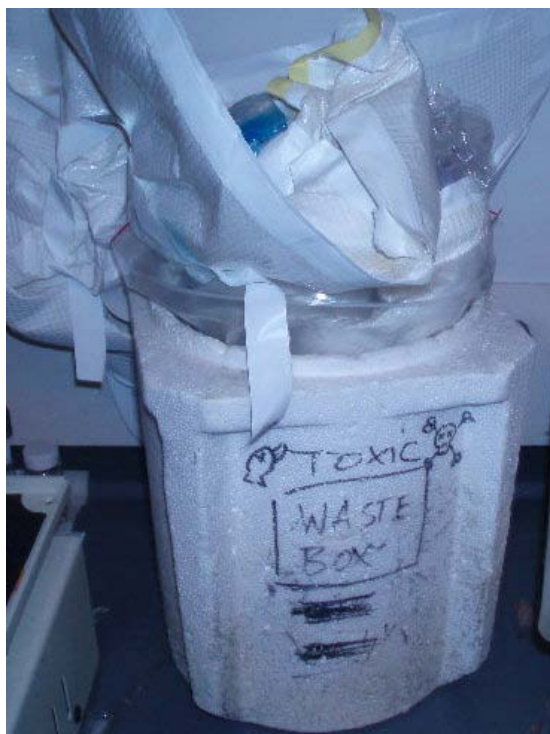
Photo 7: open, unlabeled, overflowing styrofoam hazardous waste container