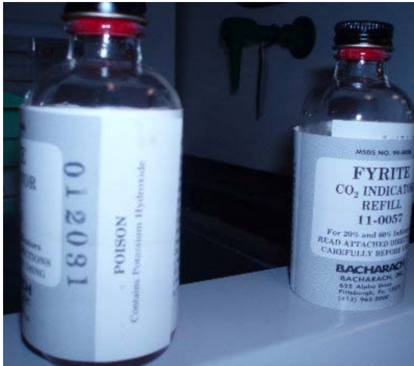
Photo 19: unlabeled bottles of discarded potassium hydroxide in the Wiencke Lab