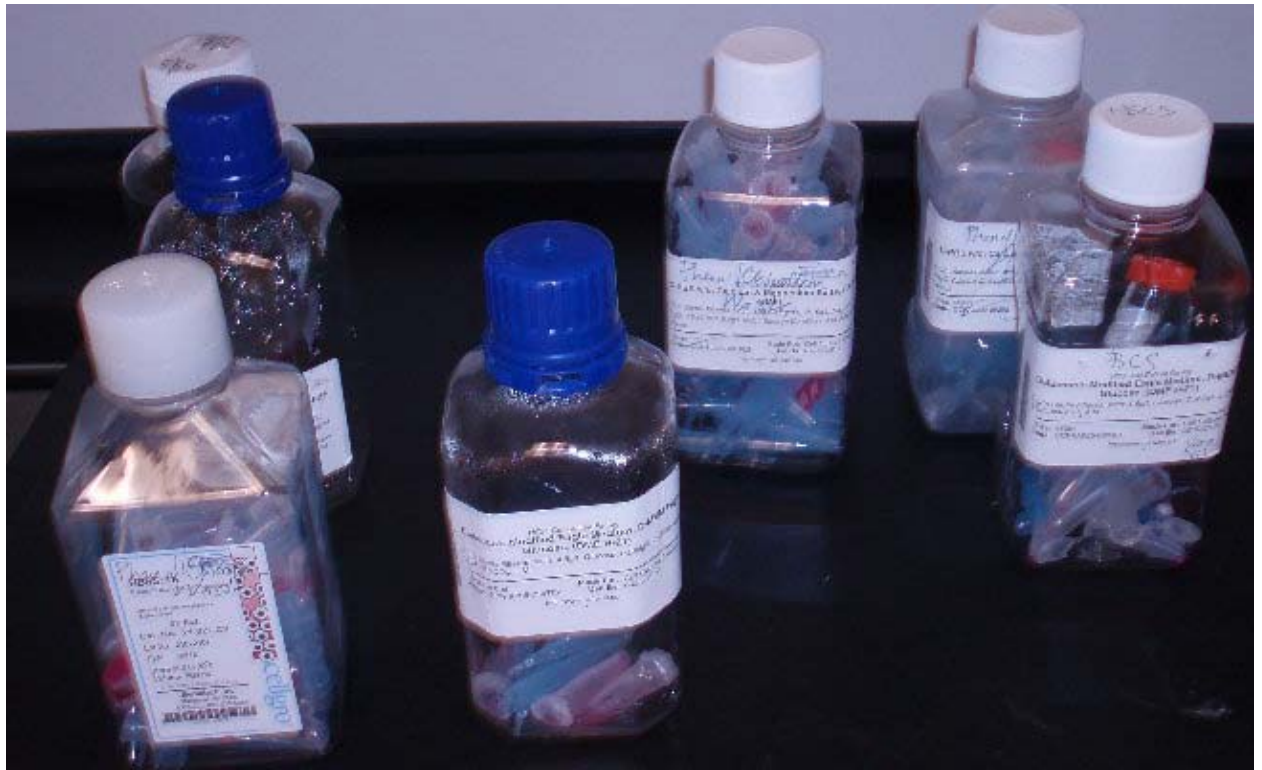
Photo 18: six unlabeled bottles of waste phenol chloroform in the Long-Cheng Li Lab