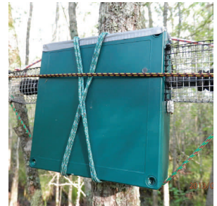
Wildlife Acoustics Automatic Recording Devices are used to monitor vocal anuran communities at Swanquarter NWR.

recommended techniques to provide an evolving, quick guide to determine which protocol or technique best fits a refuge's objectives or question they need addressed. This is an evolving document and will periodically be updated with additional surveys. (ServCat record 53954). Contact Wendy Stanton.