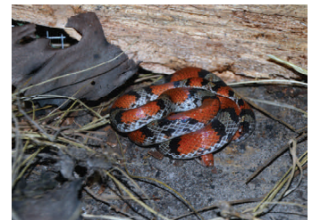
Northern Scarlet Snake, Cemaphora coccinea opei Big Branch Marsh NWR June 2015.

species, 6 species of lizards and 1 crocodylian (American Alligator) were observed. Species of note included; the Eastern Spadefoot Toad (see species highlight), the Eastern Glass Lizard and Northern Scarlet Snake. The Eastern Glass Lizard and the Northern Scarlet Snake are species of state conservation concern. Prior to this survey, there was only one record of a Northern Scarlet Snake in St. Tammany Parish. Also of interest is the melanistic (i.e., all black) glossy crayfish snake, which appears to be a first for record for St. Tammany Parish. Contact Sue Wilder.