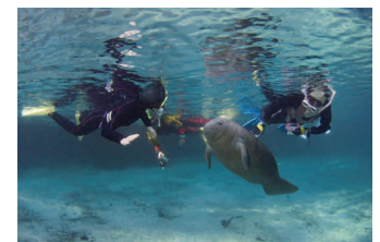
Manatee at Crystal River NWR

NWR is about to send the first, site-specific I&M protocol for national review. We applaud the refuge staff and volunteers on their dedication to scientific integrity and implementation of an excellent monitoring program. We, on the SE Region I&M team, look forward to working with every refuge to develop more quality monitoring protocols. Contact: Tim Fotinos or Janet Ertel.