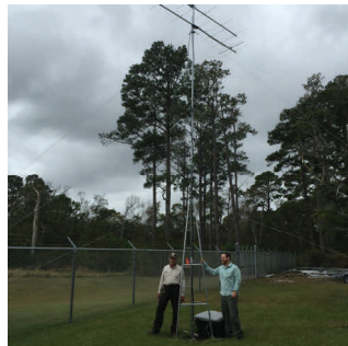
The newly installed Motus Wildlife Tracking System at Cedar Island NWR in North Carolina.

multiple species of seabirds, shorebirds, songbirds, raptors, and bats. They count on tracking stations along the route to record passing animals. Receiving stations log tag detections in real time, and flying animals can usually be detected by the station up to 15-20 km away. For more information, contact Adam Smith.