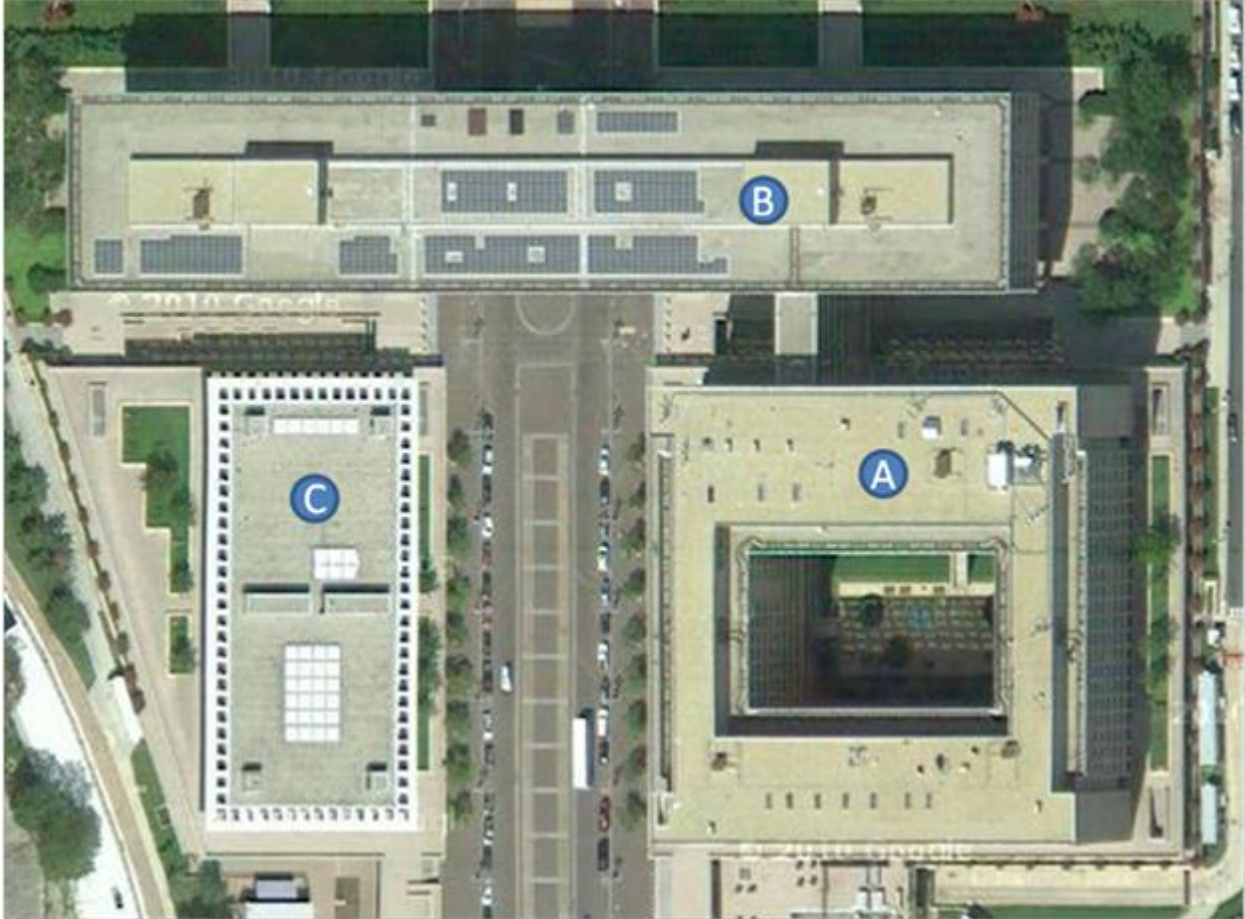
Figure 2. Aerial view of the Forrestal Building showing the South Building (A), the North Building (B) and the West Building (C).