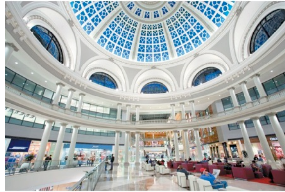
San Francisco Centre