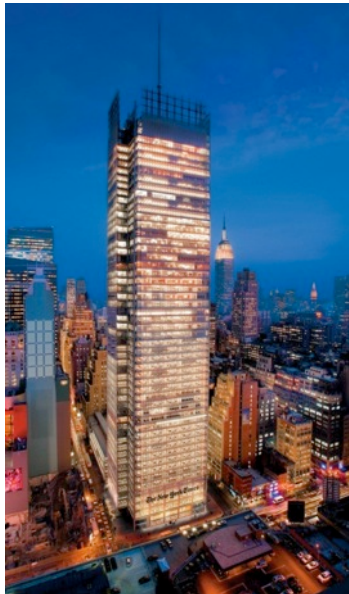
New York Times Building