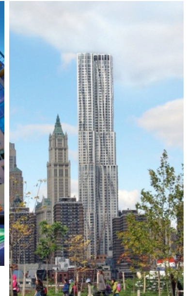
New York by Gehry at 8 Spruce Street