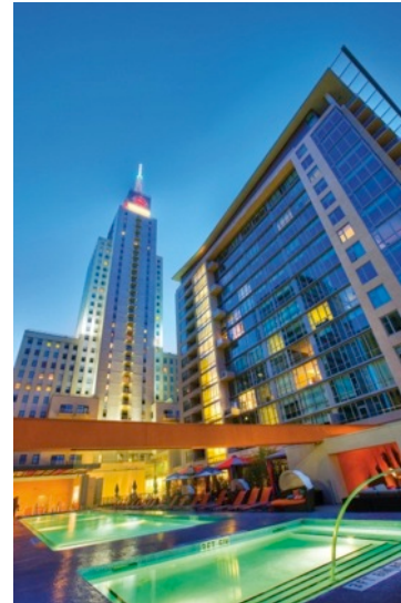
Mercantile Place on Main, Dallas