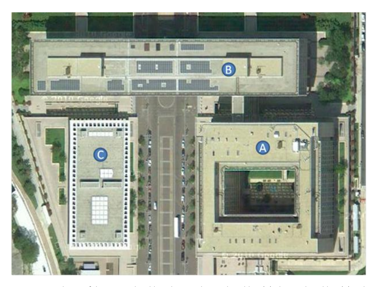
Figure 2. Aerial view of the Forrestal Building showing the South Building (A), the North Building (B) and the West Building (C).