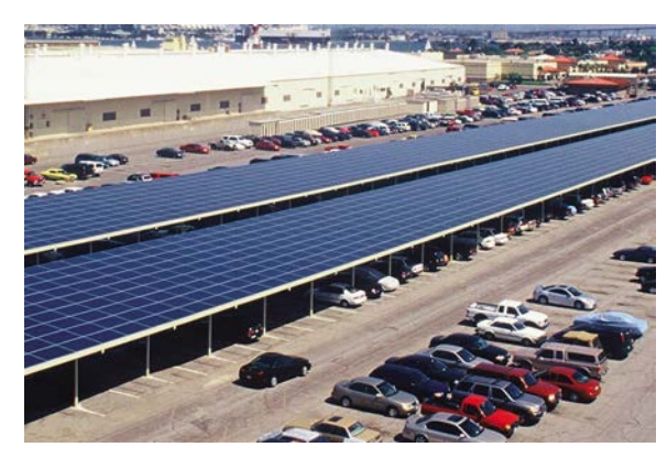
A large commercial carport-mounted PV array.