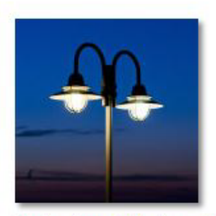
Technology Solutions Teams Energy Management & Information Systems, Food Service, Laboratories, Lighting & Electrical, Plug & Process Loads, Space Conditioning, Refrigeration