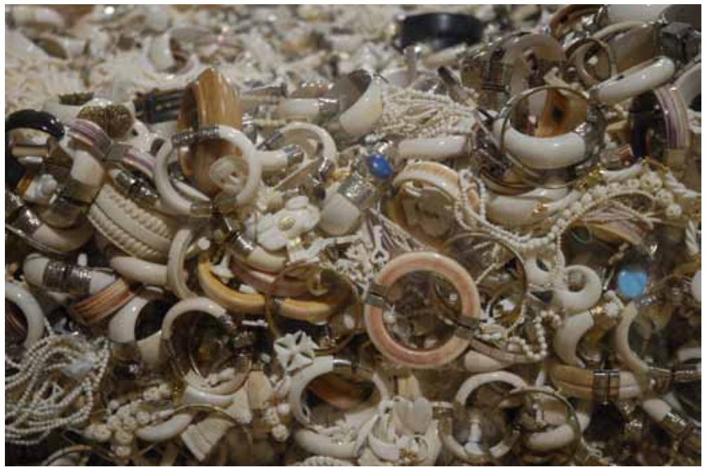
Three New York companies forfeited nearly one ton of products made from elephant ivory.

Two poachers face fines of up to $250,000 and five years of jail time for illegally harvesting striped bass in the Chesapeake Bay over a four-year period. Two defendants pled guilty to charges of conspiring to violate the anti-poaching Lacey Act and