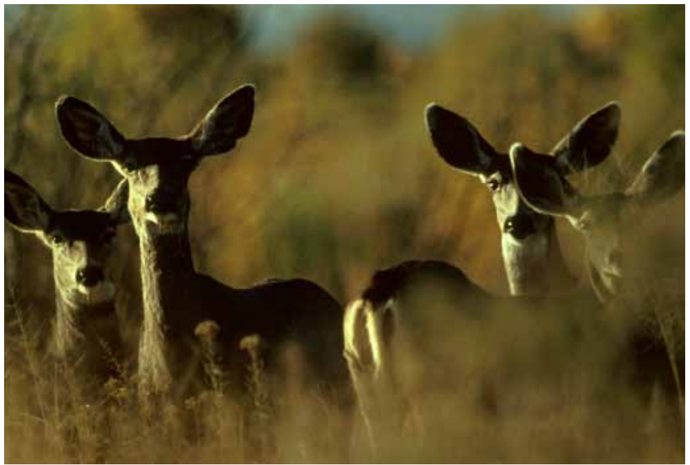
Two hunters paid $13,500 in penalties and forfeited $4,000 worth of equipment in connection with a "killing spree" in South Dakota; "victims" included a bison and several mule deer.

Three former officials of an Indian tribe, one of whom was their Director of Fish and Game, were ordered to pay $56,625 in restitution to the tribe in connection with four unauthorized high-dollar value big game hunts provided at tribal expense to