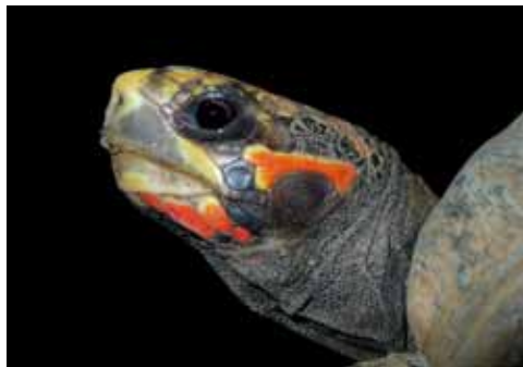
Two defendants were successfully prosecuted for smuggling native reptiles (including red-footed tortoises) and foreign species into Canada.

prosecuted in Canada, where he was found guilty of two counts of violating that country's major wildlife law. He was sentenced to serve 90 days in jail, spend three years on probation, and pay $50,000 (Canadian) in restitution to Canada's Environmental Defense Fund. The smuggled reptiles were forfeited to the Crown.