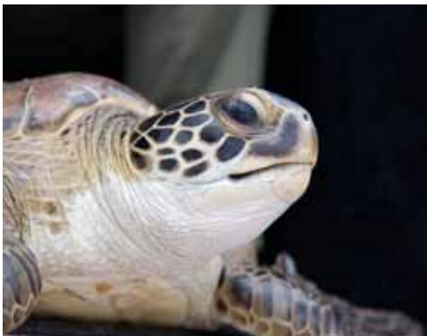
The Service documented the illegal take and trafficking of protected green and hawksbill sea turtles in Puerto Rico.

A South Carolina man investigated by Service and State officers pleaded guilty in State court to killing an endangered wood stork and was ordered to pay $5,000 in restitution.