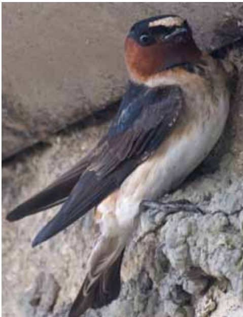
Agents secured $375,750 in remediation from a construction company that destroyed at least 800 cliff swallow eggs.

a bridge repair project site in Oklahoma agreed to pay $375,750 in remediation to avoid prosecution for violations of the Migratory Bird Treaty Act.