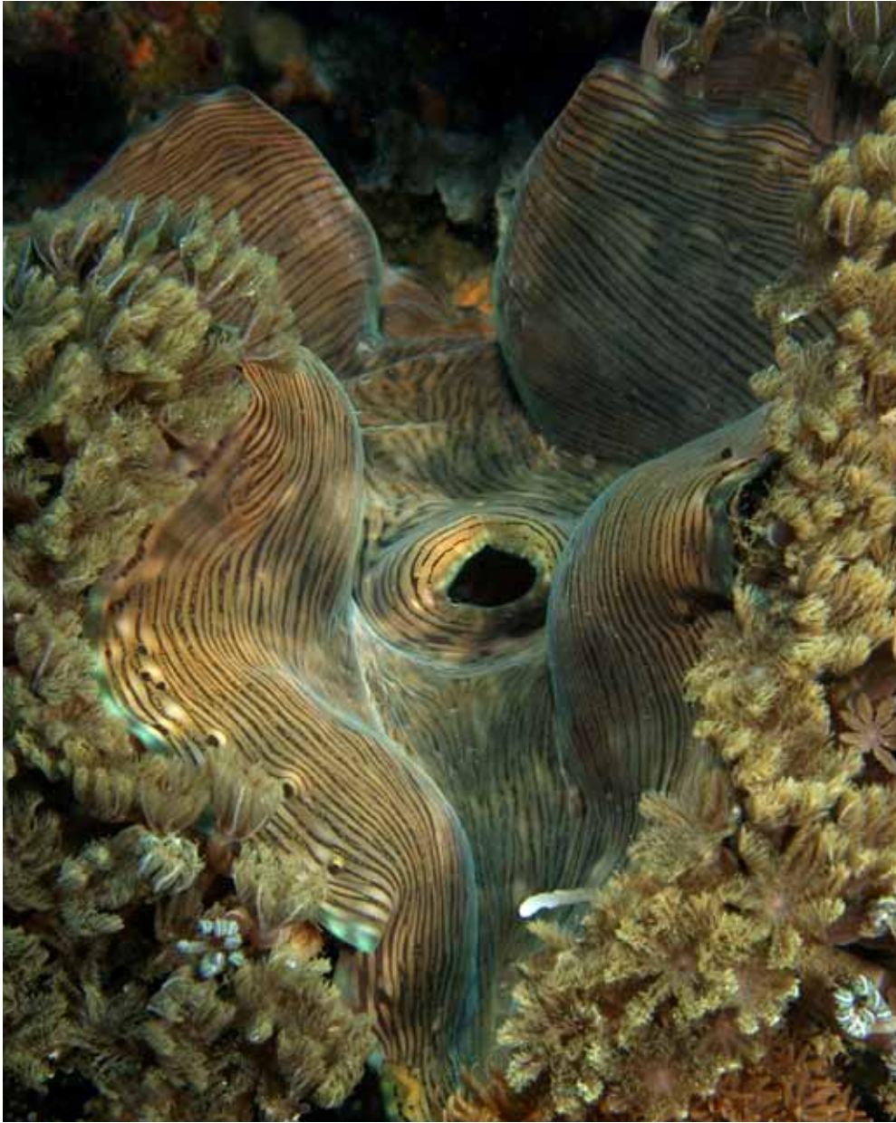
Investigations involving giant clam (a CITES Appendix II species) dealt with both unlawful harvest and meat smuggling.

dead CITES-protected corals and giant clams that had been unlawfully harvested from waters surrounding the Marshall Islands. The wildlife was recovered from two U.S. Navy vessels manned by contractors that were returning to Hawaii after conducting missile launch operations in Kwajalein. An investigation resulted in the indictment of the Captain on smuggling and Endangered Species Act charges. The investigation was worked jointly with special agents from the National Marine Fisheries Service.