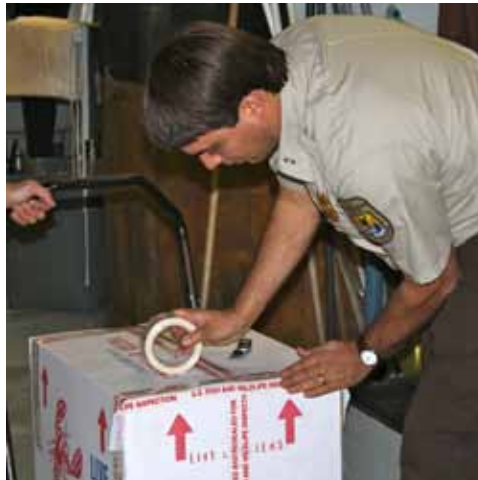
An inspector in Newark, New Jersey, reseals a carton of live wildlife after examining its contents for contraband.

Inspectors worked closely with U.S. Customs and Border Protection and other Federal inspection agencies. At many ports, they provided wildlife import/export training to these officers. The Service trained new agriculture inspectors and military customs officers as well.