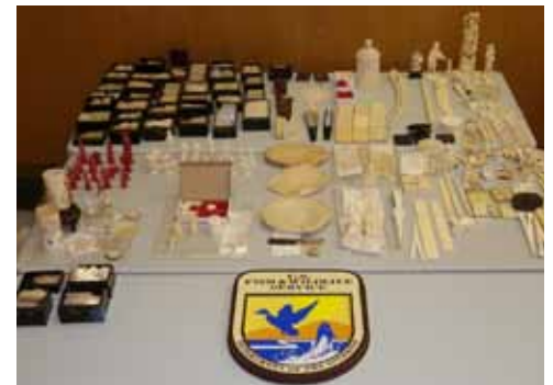
Elephant ivory seized by Service agents in Ohio.

The main defendant in Operation Treed – a 3-year Service/State investigation of the illegal killing of bears and other wildlife by houndsmen in Wisconsin and other States – was sentenced after pleading guilty to making false statements and violating the Lacey Act in connection with his commercial guiding activities. He was ordered to serve six months in prison, pay $10,000 in fines and restitution, lose his hunting privileges throughout North America for 15 years, and forfeit a truck, five hunting dogs, guns, and other items.