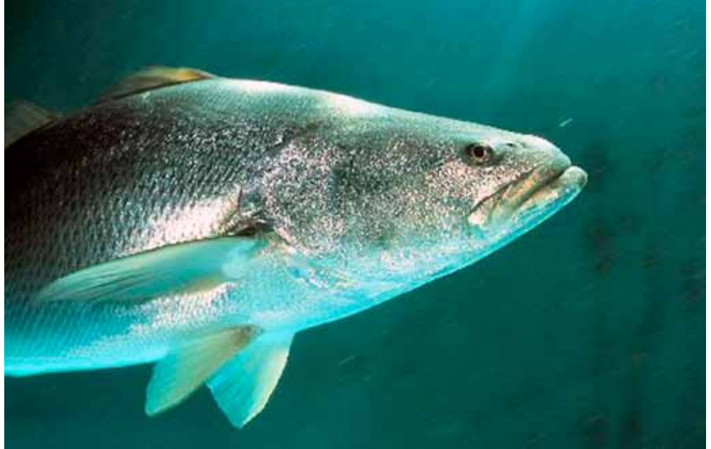
The Service broke up a smuggling ring that was trafficking in swim bladders from endangered totoaba fish from Mexico.

The Service teamed with Homeland Security Investigations and U.S. Customs and Border Protection to disrupt large-scale trafficking of swim bladders removed from totoaba fish – an endangered species that lives off the coast of Mexico. Seven individuals (including two Canadian women) were indicted on Federal charges in San Diego in connection with these smuggling operations. The more than 550 swim bladders seized are worth an estimated $3.5