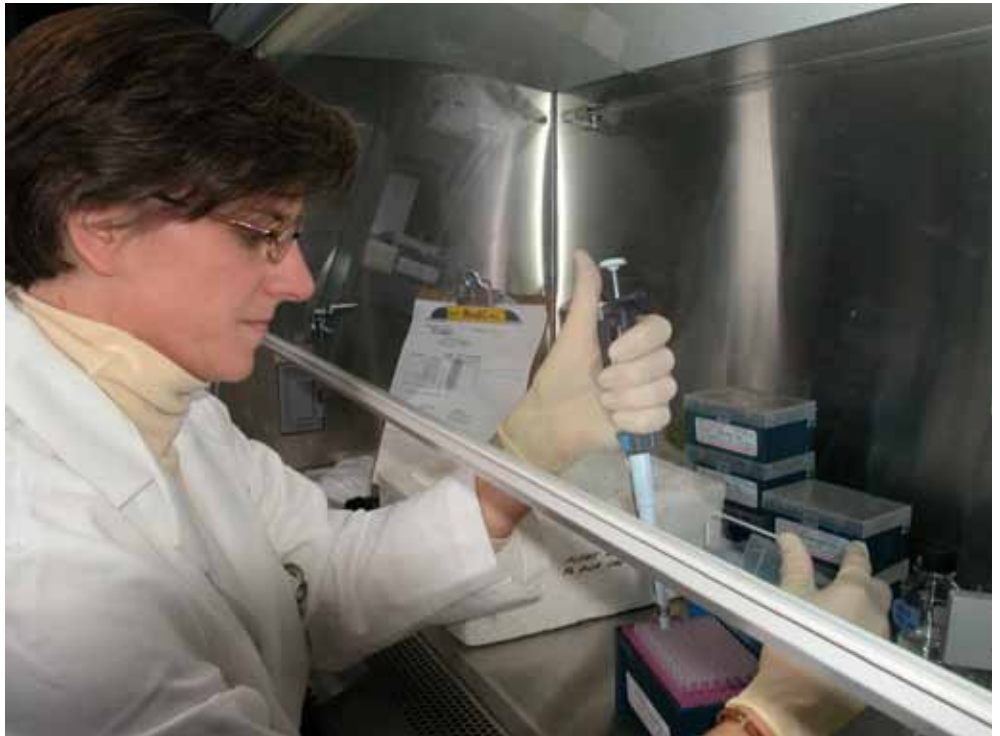
A forensic scientist prepares to conduct a DNA analysis.

In one particularly significant investigation, a Genetics Section analyst processed over 500 evidence samples for species identification of the endangered totoaba. This work helped secure the successful prosecution of five defendants who were involved in smuggling swim bladders from the fish into the United