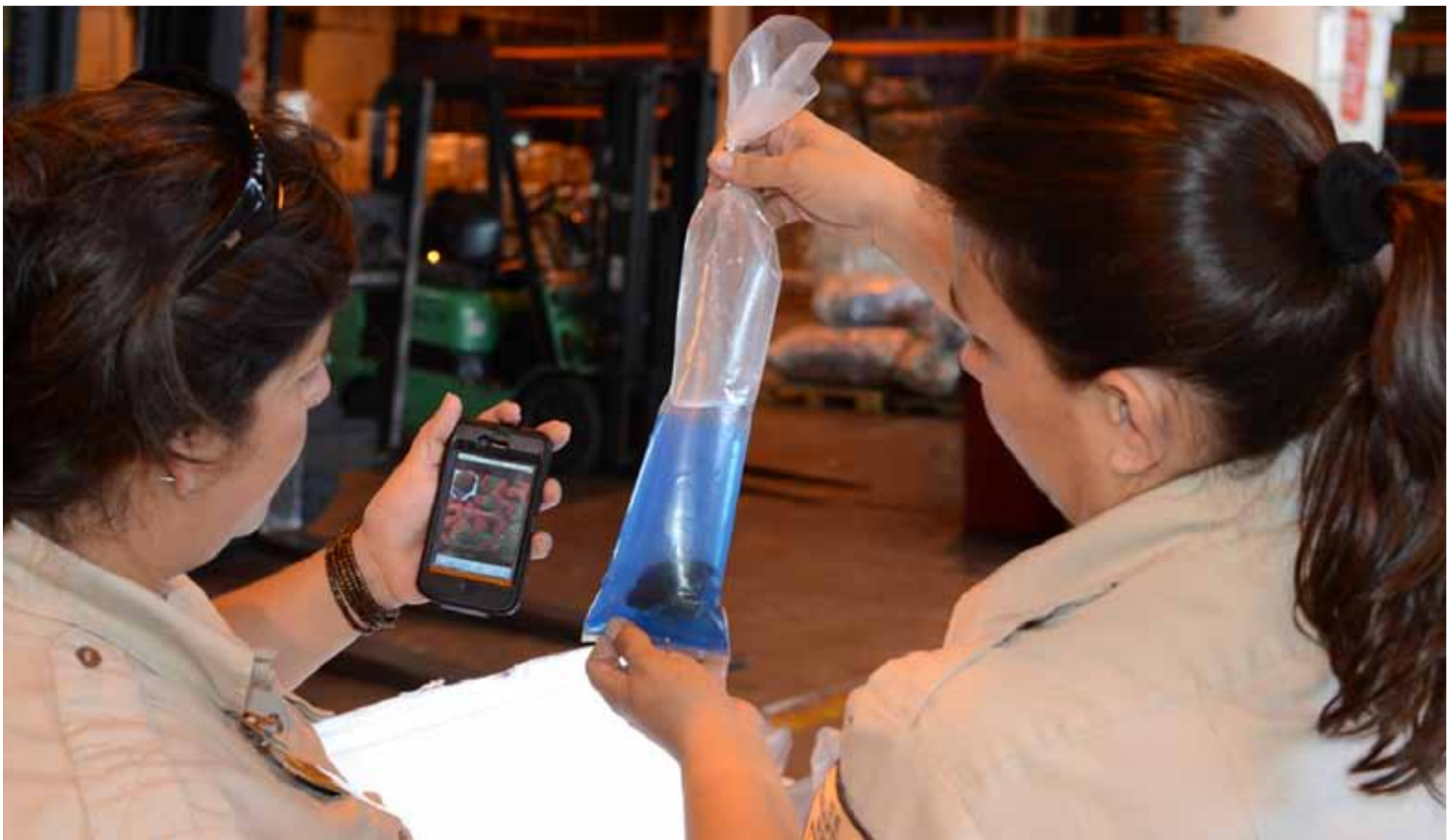
Species identification is a vital job skill for wildlife inspectors.

40 CITES-listed giant clams re-exported from Vietnam with altered permits; and a shipment from Ghana of 2,000 emperor scorpions falsely identified as to country of origin.