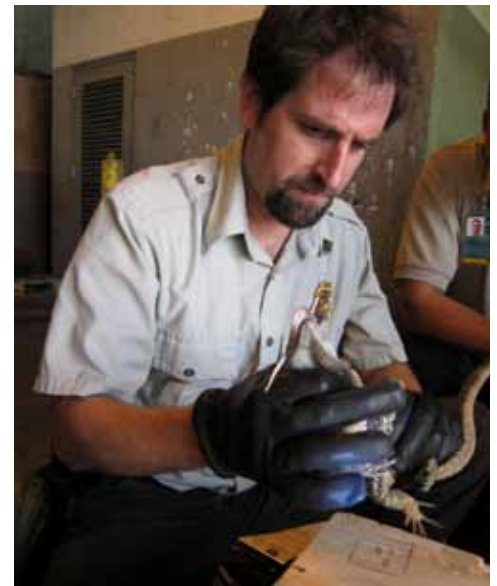
An inspector in Miami examines a live reptile shipment.

Inspectors working the U.S./Mexico border in Texas seized two large shipments of wildlife leather products crossing via Laredo and caught a manufacturer smuggling more than 10,700 tegu lizard leather and skin pieces into El Paso.