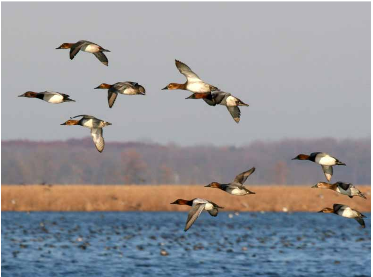
The passing of the 1916 Migratory Bird Treaty Act (Act) has many success stories for species in peril of extinction including the canvasback shown here in flight. During the turn of the century, the canvasback was a highly sought after duck for high end restaurants in large metropolitan areas. The Act essentially ended “market hunting” saving numerous species of waterfowl.

In addition, the Act places a moratorium on the importation of raw or worked ivory from African elephant-producing countries that do not meet certain criteria.