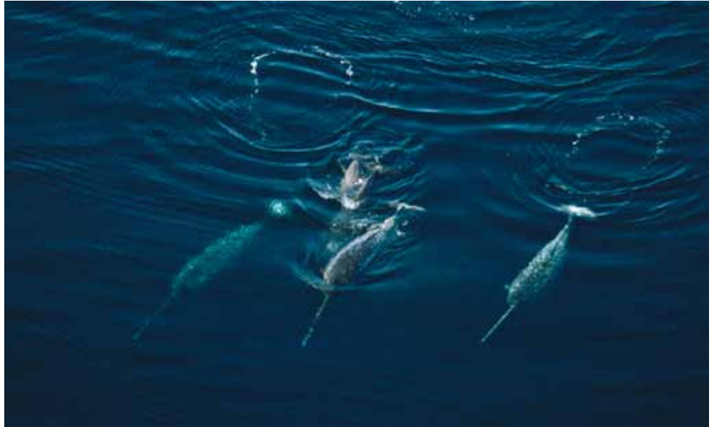
U.S. and Canadian investigators broke up a smuggling ring dealing in narwhal tusks.

A three-year investigation into the mislabeling and smuggling of rare CITES-protected stony corals resulted in the successful prosecution of a co-owner of one of the largest live coral import businesses in the United States. The defendant, who pled guilty to one felony count of smuggling, was sent to Federal prison for one year and was barred from possessing CITES species for three years following completion of that sentence.