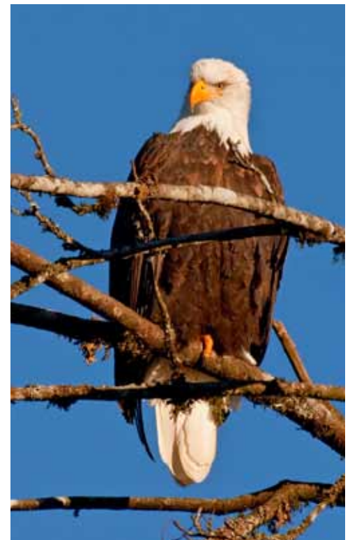
Agents in Washington State helped rescue seven bald eagles.

Prompt action by Service special agents in Washington State facilitated the recovery and transport of seven poisoned bald eagles to wild bird rescue facilities. The birds, which had fed on the carcasses of two euthanized horses that were allowed to rot in an open field, were in critical condition when retrieved by the agents but ultimately survived. The rancher responsible cooperated with investigators and paid a $1,500 fine.