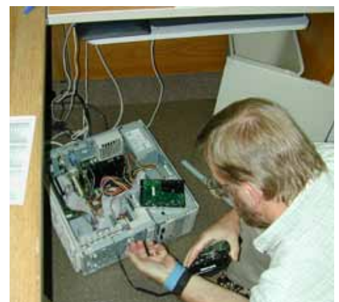
Computer forensics is vital for retrieving evidence of wildlife crimes.

Intelligence support is vital to Service efforts to identify and disrupt wildlife trafficking networks. Through the Intelligence Unit, Service investigators have access to such services as background, criminal history and financial checks; border crossing, airline and license checks; wildlife valuations; document analysis; trade research; toll record analysis; link chart creation; prior case research; and website mirroring.