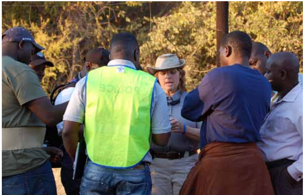
A Service special agent helps African officers complete a training exercise at the International Law Enforcement Academy in Botswana.

In October 2014, the owners of a safari outfitting company were charged with selling illegal rhino hunts to unsuspecting American hunters. The defendants allegedly failed to get required permits and later sold rhino horns on the black market. [Demand for rhino horn is soaring: In 2007, 13 rhinos were poached in South Africa. In 2013, poachers killed more than 1,000.]