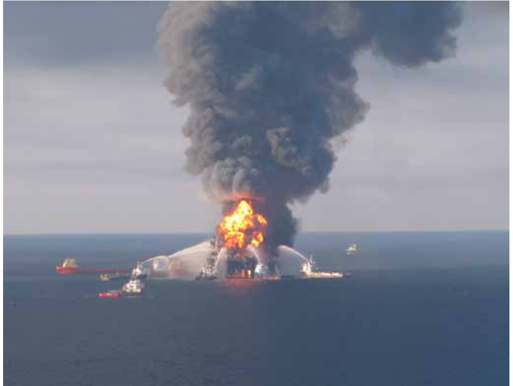
Service work on the two-year investigation of the 2010 Deepwater Horizon well blowout and oil spill secured criminal penalties for violations of the Migratory Bird Treaty Act and other Federal laws.

Service special agents and officers from the National Oceanic and Atmospheric Administration secured multiple convictions in connection with Operation Rock Bottom – an ongoing probe of the illegal harvest and trafficking of marine