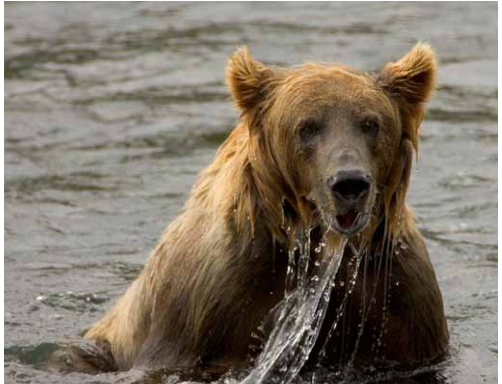
A cooperative U.S./Canada investigation documented illegal guiding and hunting of brown bear and other big game species.

Prosecutions proceeded in Operation Bruin – a cooperative Office of Law Enforcement, Canadian Wildlife Service and Alaska State investigation of unlawful guiding, illegal take, and smuggling of brown bear and other big game species between Alaska and Canada. The investigation documented two unlawful guiding