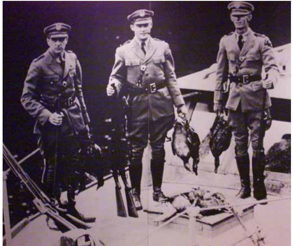
Game Management Agents aboard the M/V Eider Duck, a new patrol boat for the Division of Game Management, Game Protection Service of the U.S. Biological Survey. Portland, ME. 1936.

Marine Mammal Protection Act (16 U.S.C. 1361-1407). This Act establishes a moratorium on the take and importation