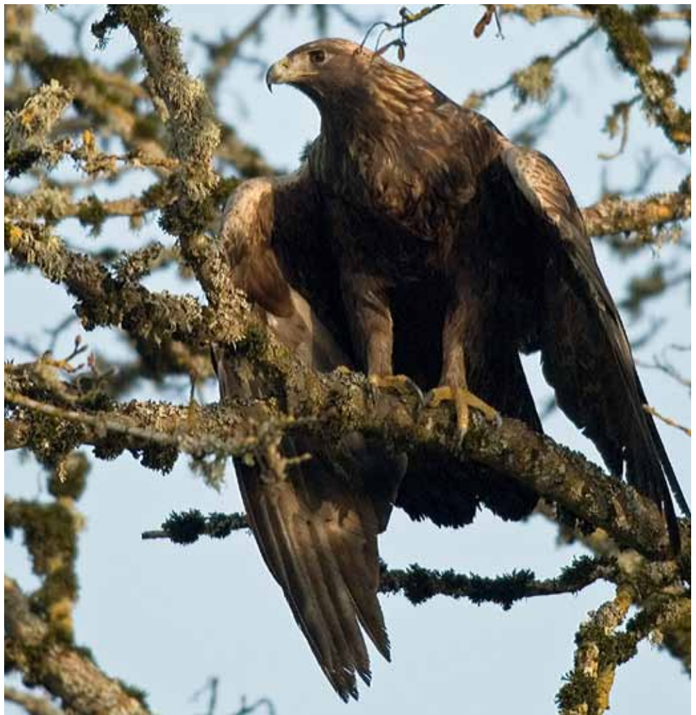
A wildlife researcher involved in the illegal capture and banding of golden eagles pleaded guilty to violating the Bald and Golden Eagle Protection Act.

A San Gabriel, California man was taken into custody at his home in Southern California after a warrant was issued for his arrest for the role he played in smuggling 26 Eastern box turtles (CITES Appendix II) and 20 African spurred tortoises (CITES II) out of the United States. The packages, which were declared as toys, had been refused due to the sender's name being on a U.S. Postal Export Compliance Group's "Federally Prohibited Export List." The packages began to give off a strong odor after sitting at the postal facility for several days. The subject was indicted on a total of six counts of outbound smuggling and Lacey Act false labeling charges, and ultimately