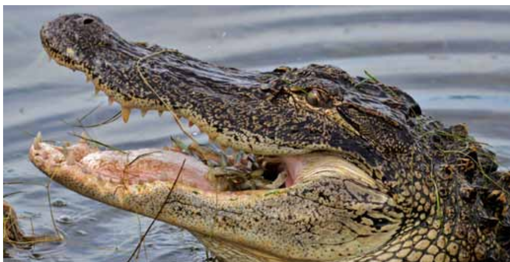
Agents investigated two Texas hunting guides for illegal take of American alligators.