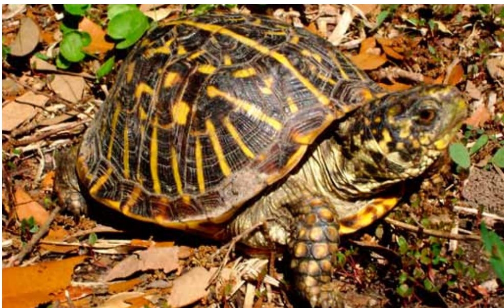
U.S. species being smuggled to Hong Kong by a reptile dealer in Washington State and five co-conspirators included ornate box turtles.