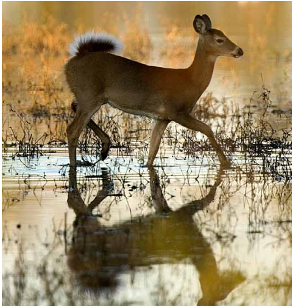
A Service/State investigation of a Texas deer ranch that unlawfully “imported” deer from Missouri resulted in a guilty plea from a major stakeholder in the business.

An Oklahoma resident pled guilty to two counts of violating the Lacey Act for transporting unlawfully taken and possessed elk and black-tailed deer in interstate commerce. He was sentenced and ordered to pay $2,500 to the Lacey Act Reward Account, a $500 fine, and serve one year probation. He was also required to forfeit wildlife seized in the investigation.