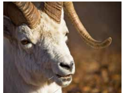
A guide was fined $20,000 for providing illegal Dall sheep hunts to his clients on the Arctic National Wildlife Refuge.

The Service law enforcement and marine mammals programs in Alaska and the Indigenous Peoples Commission on Marine Mammals co-sponsored a workshop for Native Alaskan hunters and handicrafters to