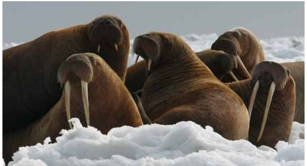
Investigations targeted both wasteful take of walrus and walrus ivory trafficking.

A Service investigation into violations committed from 2005-2009 by hunt guides and clients on the Arctic National Wildlife Refuge is nearing completion with one remaining defendant. To date, 16 subjects-- including two master guides operating two separate guiding businesses on Arctic National Wildlife Refuge, one registered guide, six assistant guides, one packer, and six clients-- have