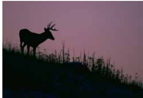
Two investigations in Iowa focused on guides providing illegal deer hunts to out-of-state clients.

Another guide was arrested by Service special agents after he was indicted by a Federal grand jury in Iowa on three felony Lacey Act counts and one count of being a felon in possession of a firearm. This individual owned and operated an outfitting company based in Greencastle, Missouri, which sold guided deer hunts in southern Iowa and northern Missouri to dozens of hunters from Pennsylvania and New Jersey.