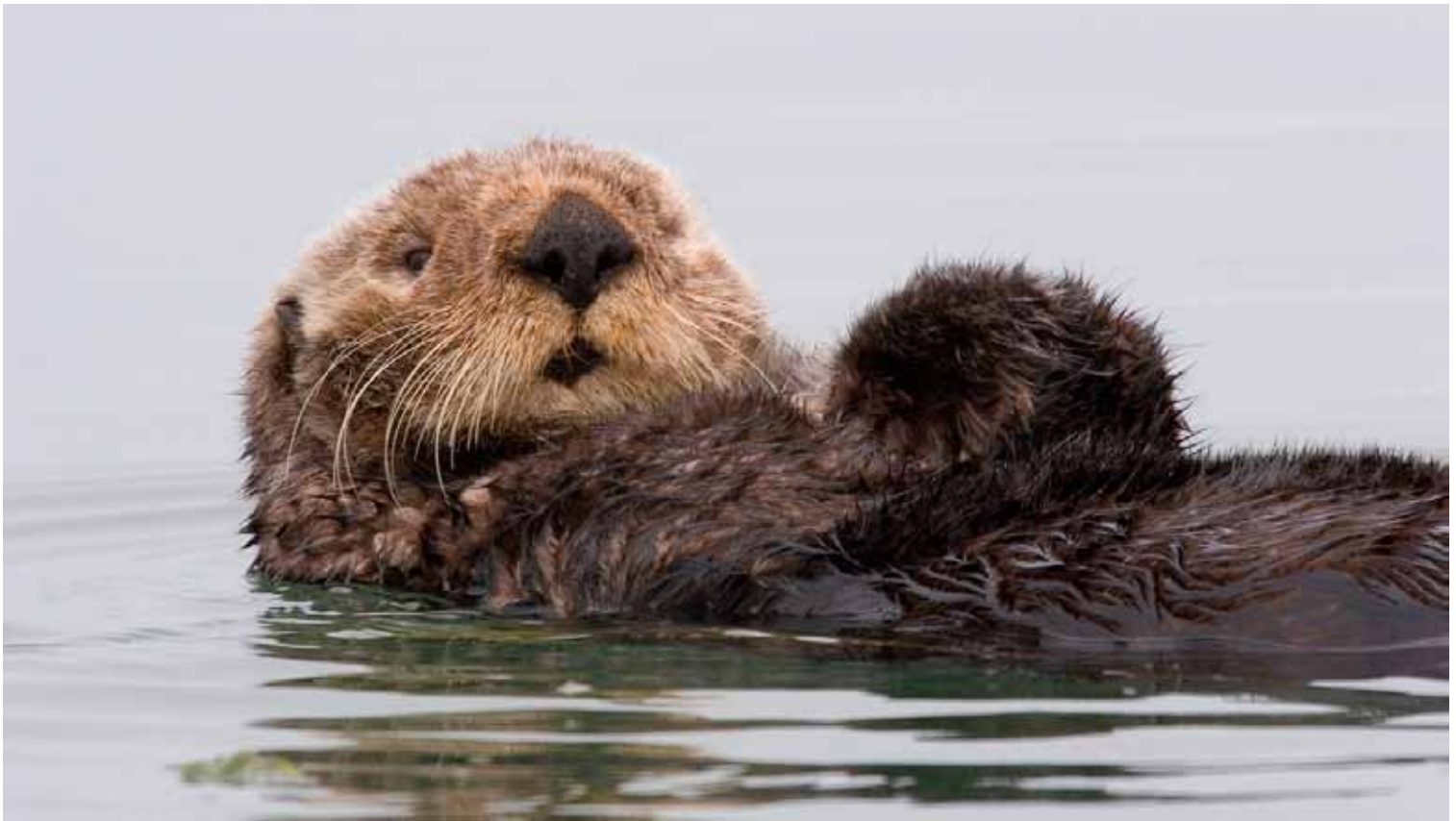
Additional defendants were sentenced in an investigation of the illegal take and trafficking of sea otters.

subsistence salmon commercialization in Alaska, were cited for Lacey Act violations and paid $6,825 in penalties.