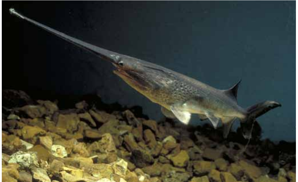
Agents arrested seven individuals for trafficking in caviar from illegally taken American paddlefish.

Seven men involved in the black market interstate or international sale of paddlefish roe were arrested by Service special agents on Federal felony charges in a multi-State “takedown” of a joint Service/ undercover investigation. An eighth Federal defendant, also indicted on felony charges, turned