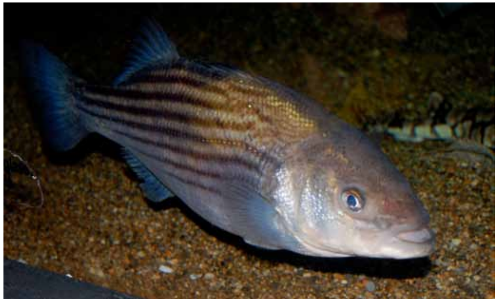
An investigation of the illegal harvest and sale of striped bass from the Chesapeake Bay resulted in the arrest of a licensed commercial fisherman.

defraud the United States through their actions. Between 2007 and 2011, the men caught and sold about 186,000 pounds of the fish, exceeding quotas and pocketing nearly half a million dollars. The Tilghman Island, Maryland, men illegally weighted nets, falsified permits, and set nets at night and out of season. Service special agents and the Maryland Department of Natural Resources conducted the investigation, which was sparked after a discovery of illegally-set nets off Kent Island in February 2011.