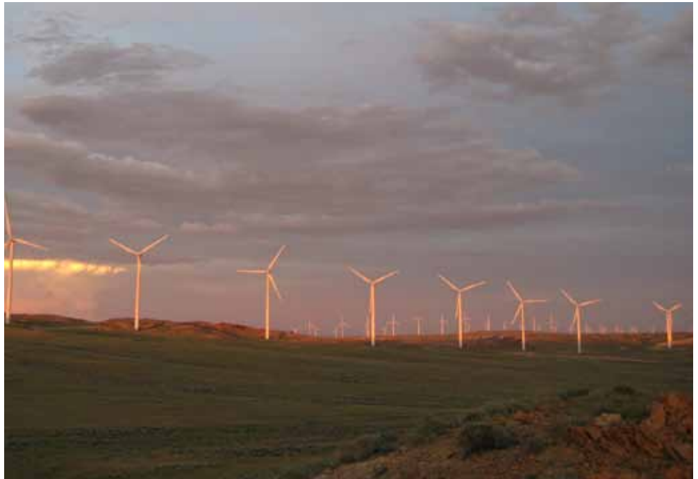
Service special agents in Wyoming secured the first criminal prosecution of a wind farm in connection with the deaths of protected birds.

A major power company pled guilty to violating the Migratory Bird Treaty Act in connection with the deaths of at least 14 golden eagles and more than 150 other protected birds at two of its wind projects in Wyoming. The company, which is the