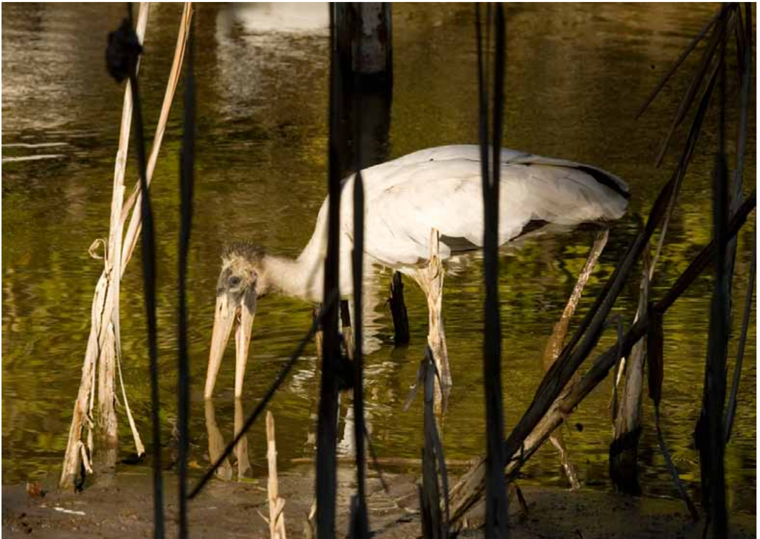
Crimes in the Southeast involving endangered species included the killing of an endangered wood stork.