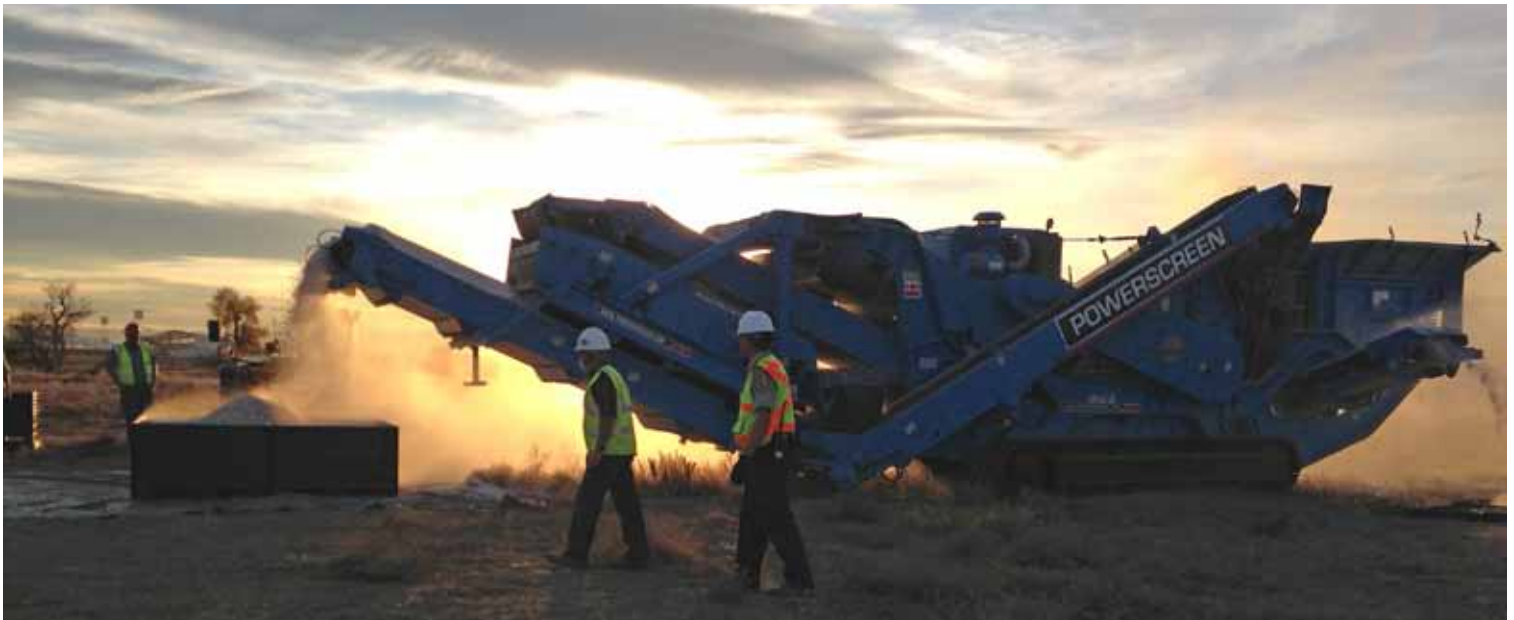
An industrial rock crusher destroyed the U.S. elephant ivory stockpile in November 2013. USFWS

into fake antiques. In addition to prison, the defendant was ordered to serve two years of supervised release and to forfeit $3.5 million in proceeds of his criminal activity as well as several Asian artifacts. Various ivory objects seized by the USFWS as part of the investigation have also been surrendered.