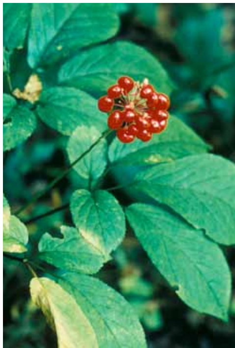
An unlicensed Wisconsin company was fined for trying to export wild American ginseng.

A Pennsylvania man – previously indicted on 16 felony Lacey act violations – was sentenced in Iowa for big game guiding violations. The guide sold trophy