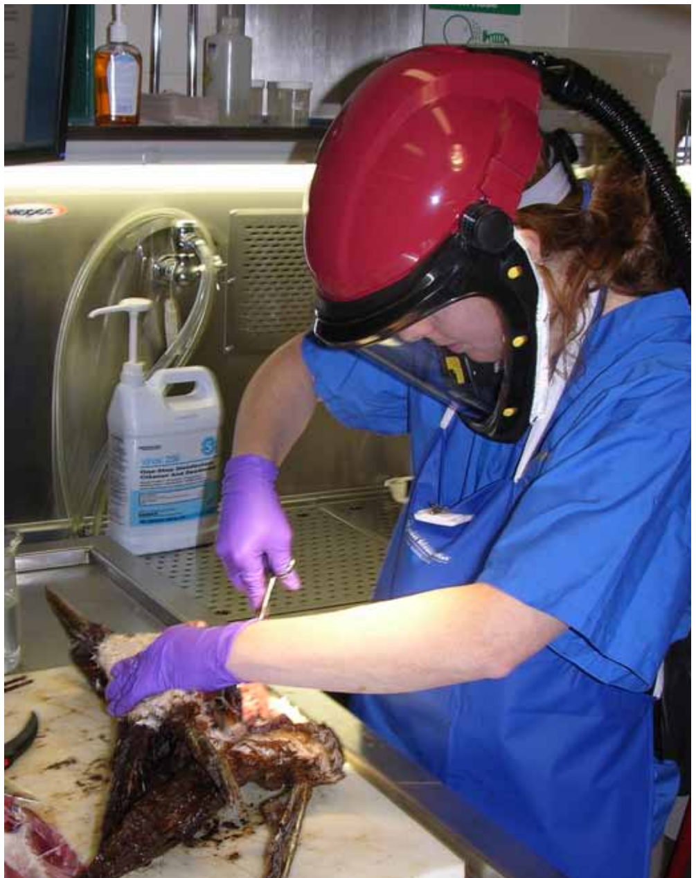
A veterinary pathologist examines an oiled bird carcass to determine cause of death.

The Office of Law Enforcement's Intelligence Unit collects and analyzes information on all aspects of wildlife trafficking to support Service investigations, inspections, and smuggling interdiction efforts. The Unit also coordinates intelligence sharing with other law enforcement agencies in the United States and other countries. It has established and maintains a broad network of domestic and international contacts with conservation groups, trade