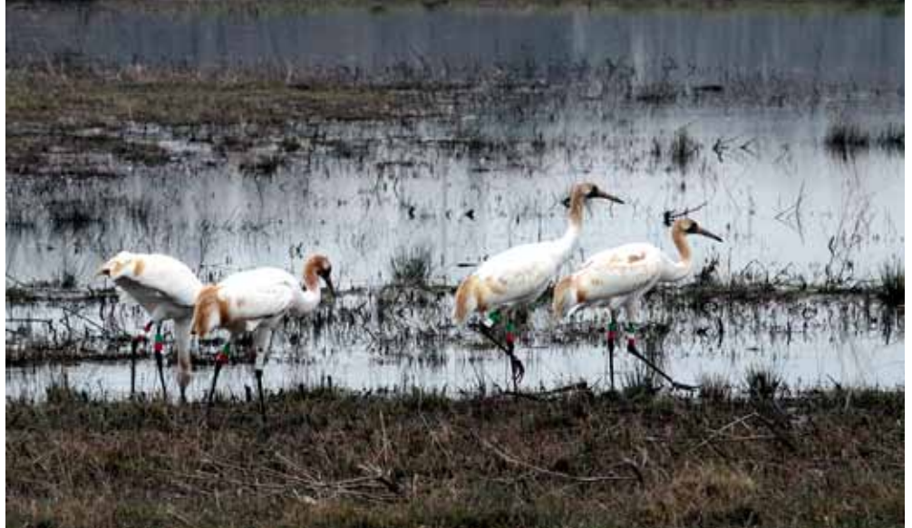
The Service secured a guilty plea from a Texas hunter who shot and killed one of only 34 juvenile whooping cranes that migrated from Canada in the fall of 2012.

An Arizona man pled guilty to stealing government property and violating international trade provisions of the Endangered Species Act by removing saguaro cacti from Federal land and selling them for about $2,000 each to buyers as far away as Austria. He was sentenced to pay $32,000 in restitution and serve five years supervised probation and eight months of weekend incarceration.