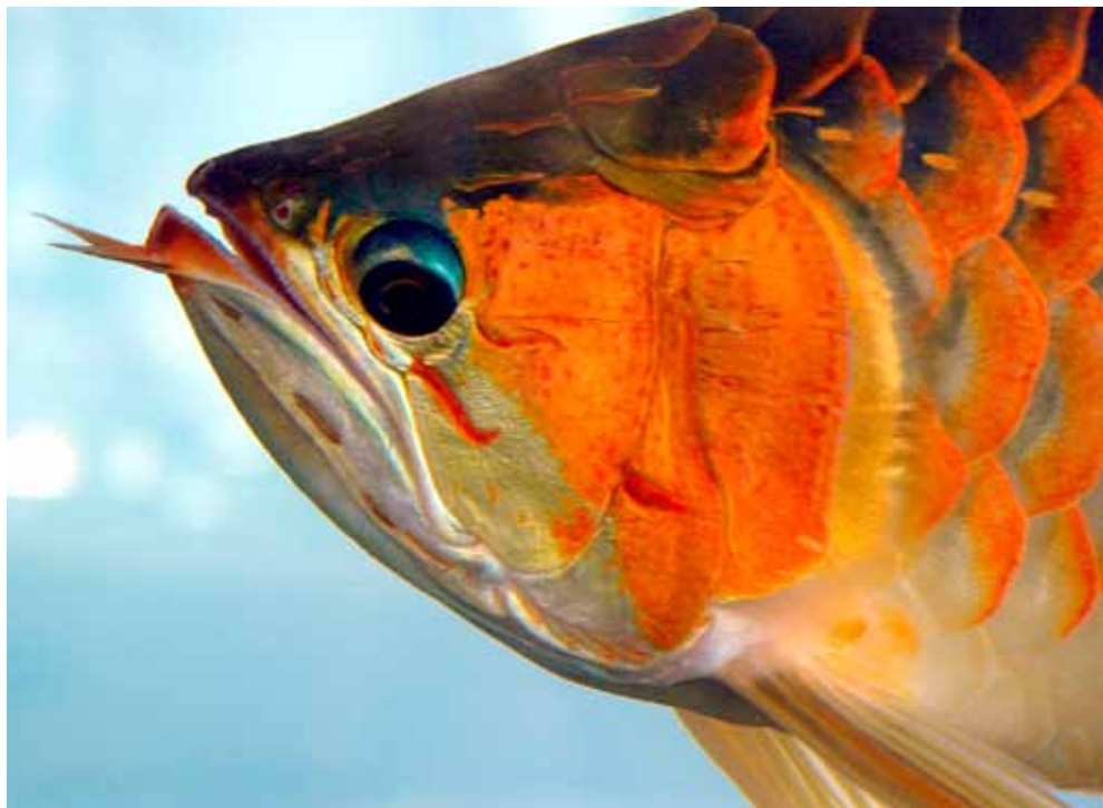
Agents completed multiple investigations involving the trafficking of live Asian arowanas – a highly valuable endangered fish.

A Senator representing Rota in the legislature of the Commonwealth of the Northern Mariana Islands pled guilty to charges that he conspired with his legislative assistant to import dead Mariana fruit bats from Rota to