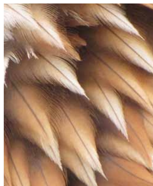
A number of investigations in the Southwest involved individuals selling golden eagle feathers and parts.

An Arizona man investigated by Service agents in coordination with Navajo wildlife officers was fined $2,000 and sentenced to 30 days in prison, five