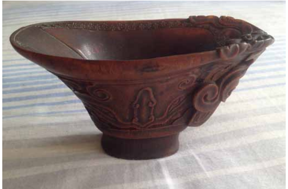
Rhino horn libation cup – one of the many rhino horn products seized as a result of Operation Crash.

These defendants abandoned their interest in $2 million worth of rhino horns and two seized vehicles. The judge also ordered that some $800,000 in cash, gold,