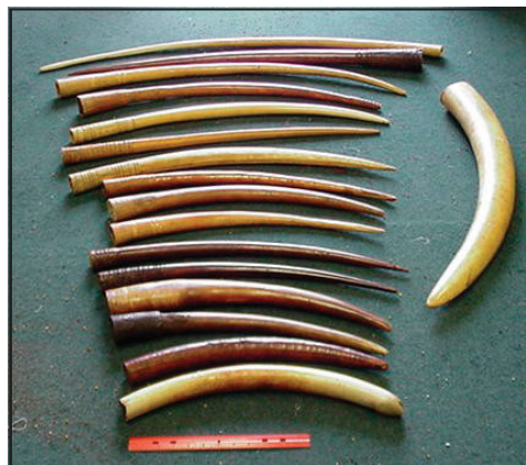
Smuggled ivory detected on X-ray at Los Angeles International Airport in Operation Loxa.