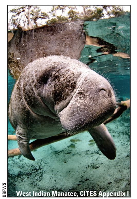
The U.S. Endangered Species Act In general, it is prohibited under the ESA to (1) take, (2) import, (3) export, (4) sell or offer for sale, and (5) possess or transport listed species.

Exceptions may be made for (1) antique items that are at least 100 years old and have not been modified or repaired using any listed species, (2) Pre-ESA specimens acquired on or before December 28, 1973 (that have not entered into commerce since that time), and (3) by permit for scientific research and/or enhancement of propagation or survival if the species is endangered or threatened, and also for zoological exhibition, educational purposes, and special purposes consistent with the ESA if the species is threatened.