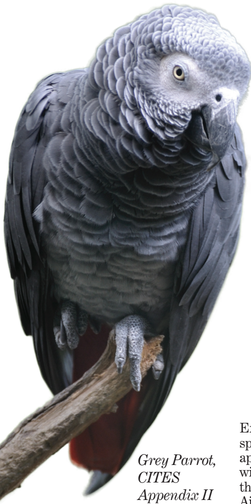
Grey Parrot, CITES Appendix II

Export permits for any CITES-listed live specimens may be issued only when the applicant demonstrates that the animals will be humanely shipped, e.g., if by air, the shipment meets the International Air Transport Association (IATA) Live