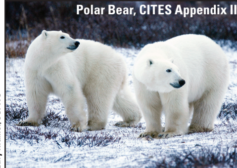
Polar Bear, CITES Appendix II

Authority (telephone 819-997-1840) and the USFWS Regional Law Enforcement Office ( http://www.fws.gov/le/ContactsSites/le_chart.htm ) associated with the port of re-entry into the lower 48 States to obtain information on what documents are required for your particular situation. Be aware, however, that souvenirs or handicrafts that contain marine mammal parts and are created by Native peoples outside of the United States (e.g., Canada or Greenland) may not be imported into the United States.