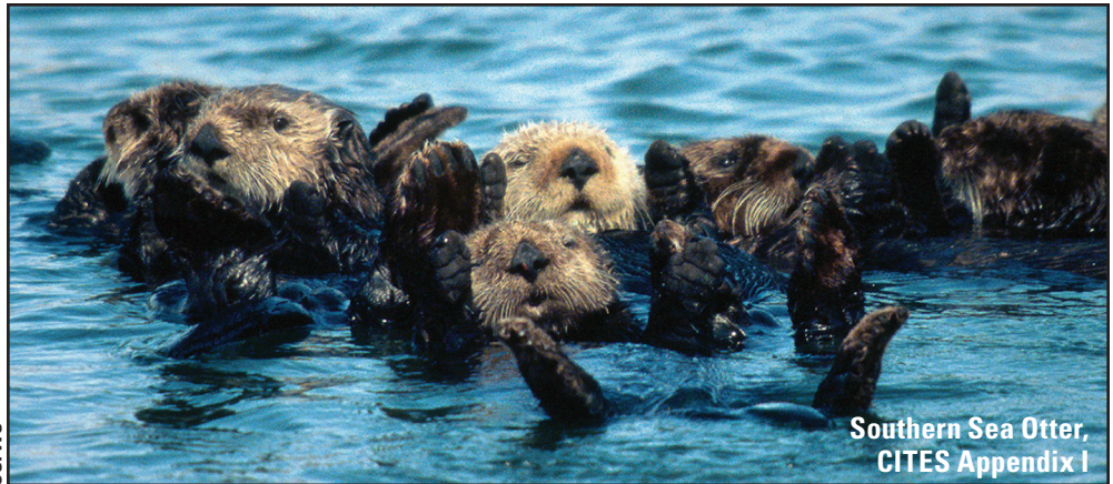
Southern Sea Otter, CITES Appendix I

Jurisdiction for marine mammals under the MMPA and ESA is shared by the U.S. Fish and Wildlife Service (USFWS) and the National Marine Fisheries Service (NMFS). The USFWS has jurisdiction for import and export of all marine mammals listed under CITES.