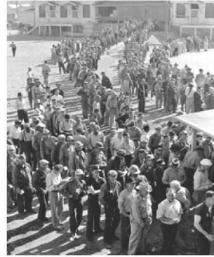
This exhibit contains audio excerpts from interviews with people who were actually there.

We Built This Dam - In the midst of the Great Depression, the construction of Grand Coulee Dam brought work and hope to thousands of jobless families. Their legacy is that they helped bring water to the thirsty landscape, security to downriver communities, and electrical power that transformed the economy of the Pacific Northwest.