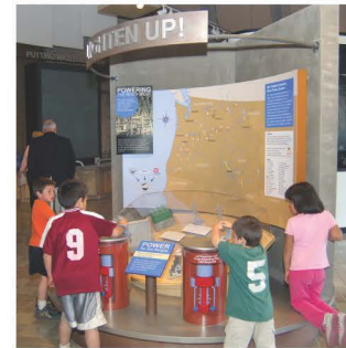
This exhibit describes the extent of the Northwest hydroelectric system.

The Northwest power system is extensive with Grand Coulee Dam as the cornerstone of the system. At 6,809 MW, Grand Coulee Dam is the largest hydroelectric facility in the United States, producing over 21 billion kW-hours of electricity each year.