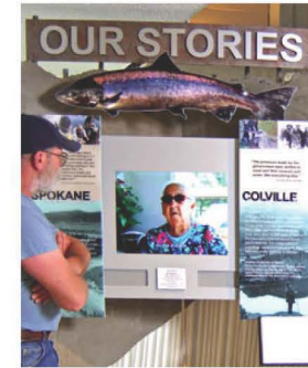
Interviews with six members of the Colville Tribe are a highlight in this exhibit.

Our Stories - The construction of Grand Coulee Dam affected the local landscape and the native people who had lived along the Columbia River for countless generations. What seemed a grand accomplishment to some was considered a destructive intrusion by many tribal members.