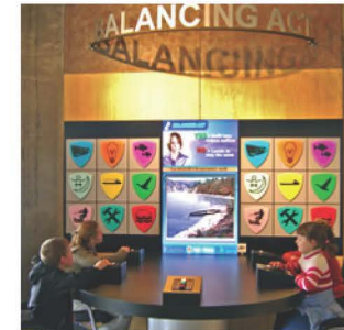
This exhibit allows you to make decisions concerning how Grand Coulee Dam is operated. It provides feedback on the benefits and consequences of your decision.

Balancing Act - Balancing operations to provide for competing needs such as flood control, power generation, irrigation, river flows for fish migration, and water for recreation can be challenging.