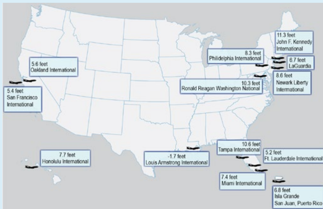
Figure 5.2. Thirteen of the nation's 47 largest airports have at least one runway with an elevation within the reach of moderate to high storm surge. Sea level rise will pose a threat to low-lying infrastructure, such as the airports shown here. (Data from Federal Aviation Administration 2012 33 ).