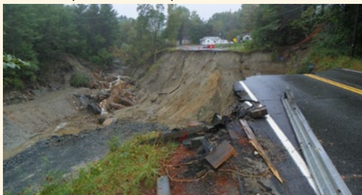
Figure 5.6. Vermont Route 131, outside Cavendish, a week after Tropical Storm Irene unleashed severe precipitation and flooding that damaged many Vermont roads, bridges, and rail lines.

Rich Tetreault of VTrans emphasized that “Certainly we will be looking to right-size the bridges and culverts that need to be replaced ... Knowing that we do not have the funds to begin wholesale rebuilding of the entire highway network to withstand future flooding, we will also enhance our ability to respond” when future flooding occurs. 74