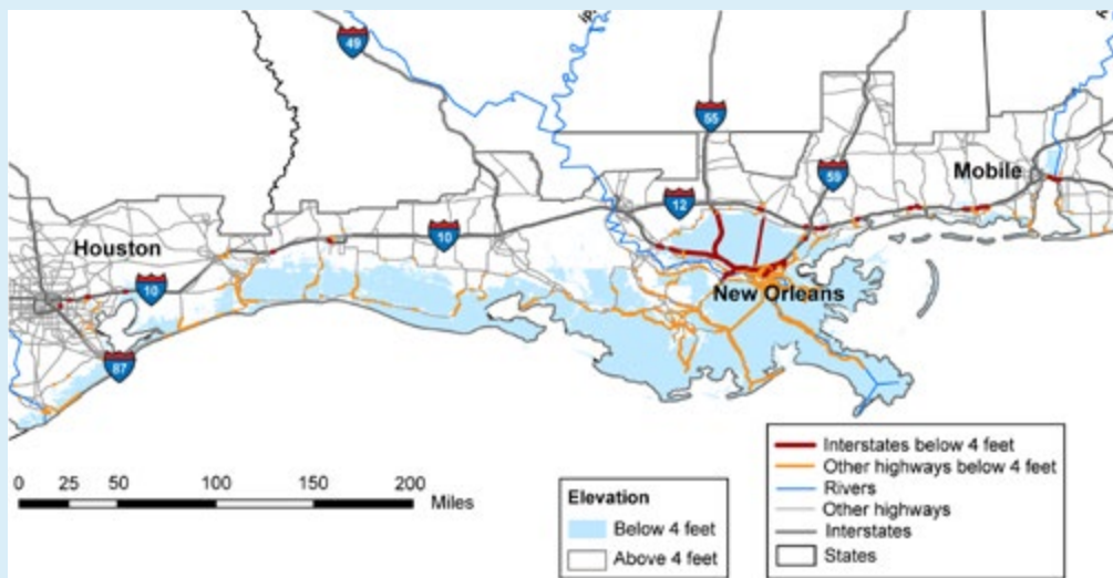
Figure 5.3. Within this century, 2,400 miles of major roadway are projected to be inundated by sea level rise in the Gulf Coast region. The map shows roadways at risk in the event of a sea level rise of about 4 feet, which is within the range of projections for this region in this century (see also Ch. 2: Our Changing Climate, Key Message 10). In total, 24% of interstate highway miles and 28% of secondary road miles in the Gulf Coast region are at elevations below 4 feet. (Figure source: Kafalenos et al. 2008 39 ).

The frequency of the strongest hurricanes (Category 4 and 5) in the Atlantic is expected to increase (see Ch. 2: Our Changing Climate, Key Message 8). As hurricanes approach landfall, they create storm surge, which carries water farther inland. The resulting flooding, wind damage, and bridge destruction disrupts virtually all transportation systems in the affected area. Many of the nation's military installations are in areas that are vulnerable to extreme weather events, such as naval bases located in hurricane-prone zones.