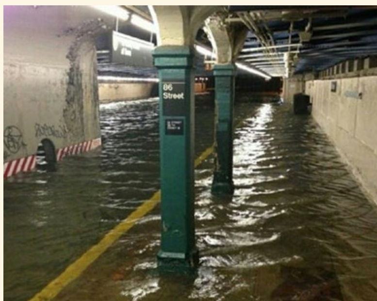
Figure 5.4. The nation’s busiest subway system sustained the worst damage in its 108 years of operation on October 29, 2012, as a result of Hurricane Sandy. Millions of people were left without service for at least one week after the storm, as the Metropolitan Transportation Authority rapidly worked to repair extensive flood damage.

wrecks, and obstructions in the channel had to be cleared before the Port was able to reopen to incoming vessels within a week. 52 Pleasure boats were damaged at marinas throughout the region. On a positive note, the vulnerability analyses prepared by the metropolitan New York authorities and referenced above provided a framework for efforts to control the damage and restore service more rapidly. Noteworthy are the efforts of the Metropolitan Transportation Authority to protect vital electrical systems and restore subway service to much of New York within four days.