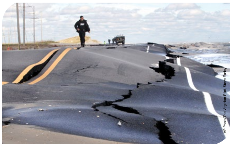
Storm surge on top of rising sea levels have damaged roads and other coastal infrastructure.

service. 14 In New York, ventilation grates are being elevated to reduce the risk of flooding. 40