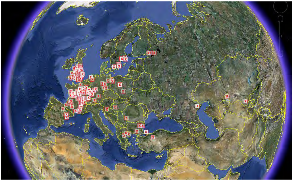
Figure 1. Global distribution of S. glanis . Map from Google Earth.