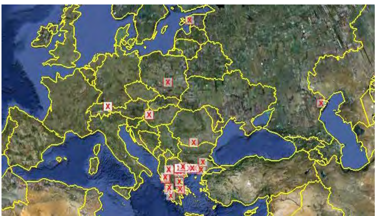
Figure 1. Global distribution of C. gibelio according to Froese and Pauly (2010). Map from Google Earth (2011).