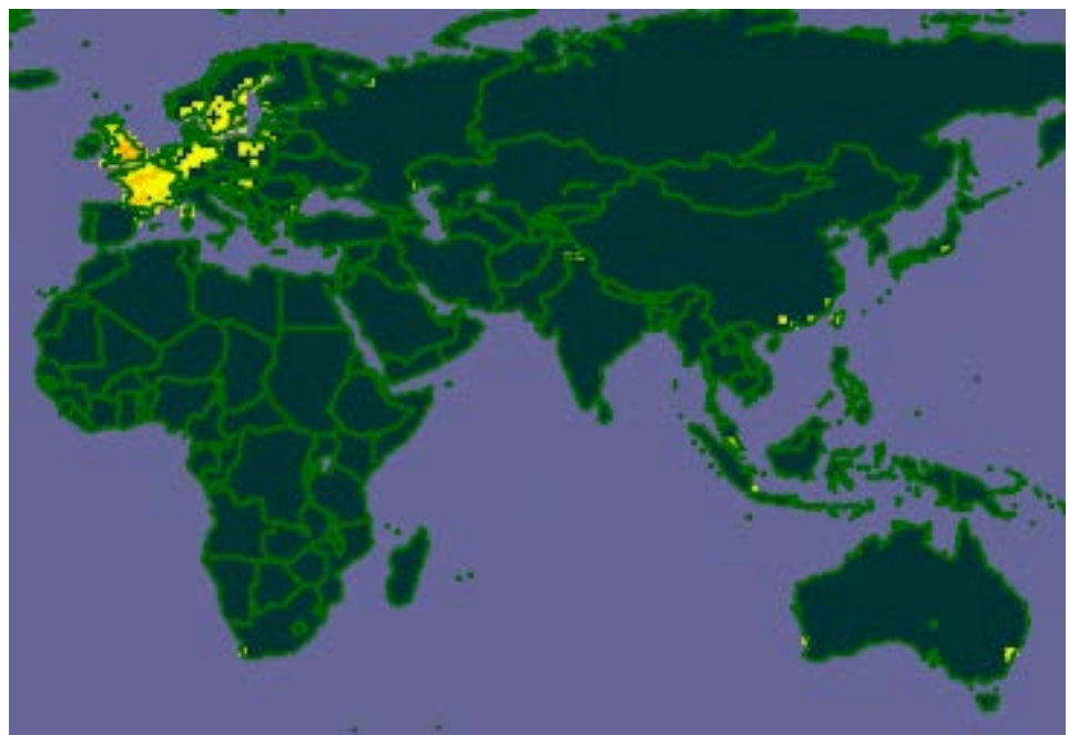
Figure 1. Global distribution of C. carassius . Map from GBIF (2011).