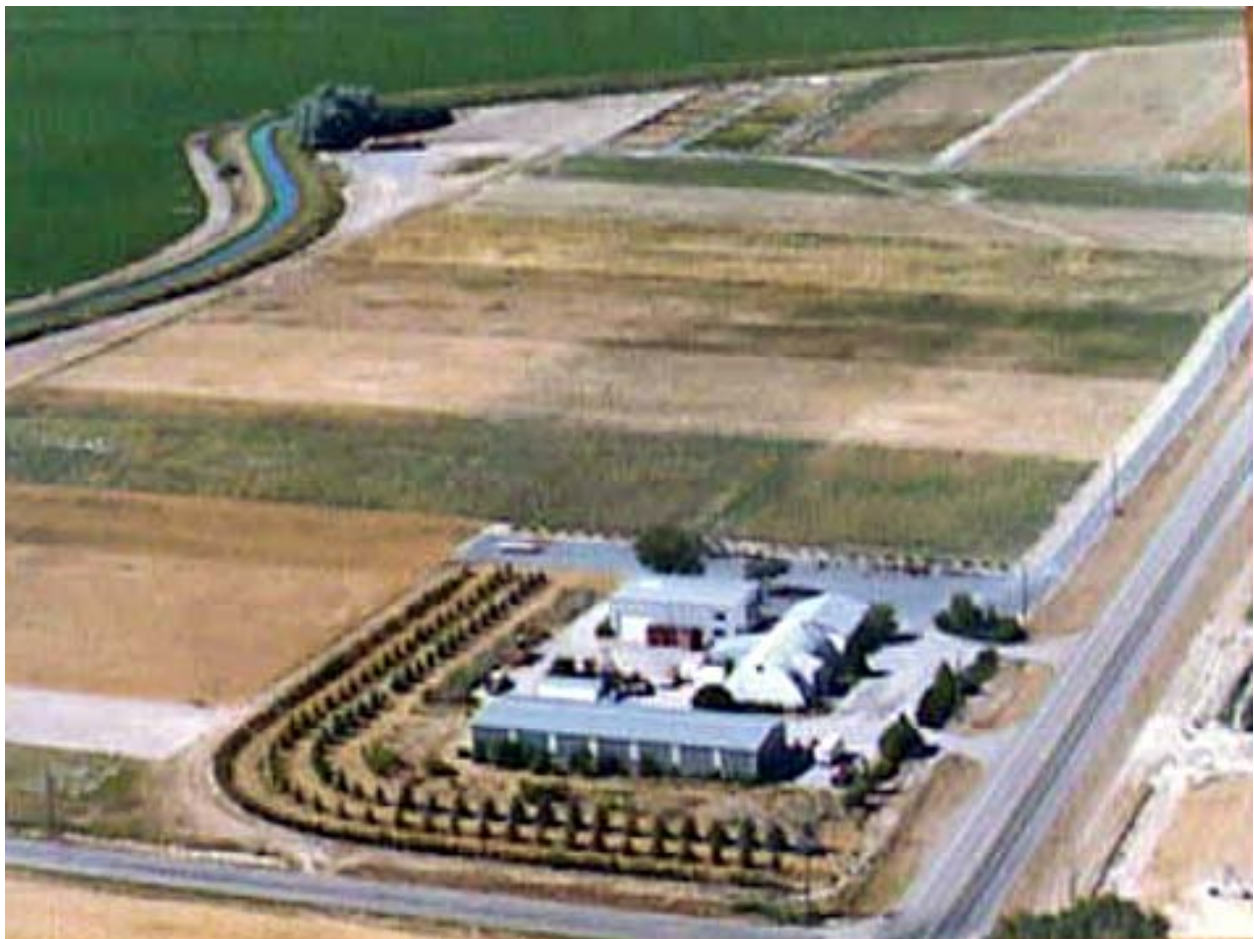
Aberdeen Plant Materials Center Home Farm