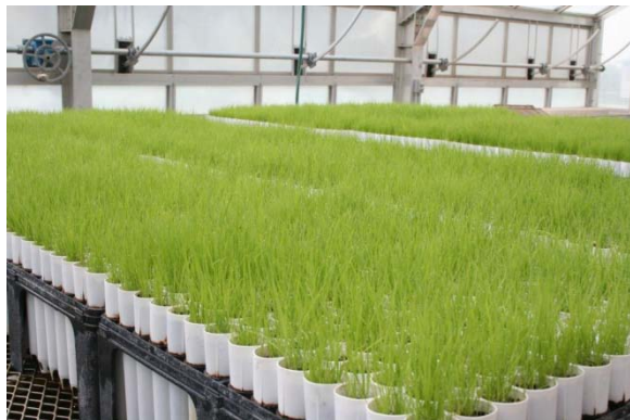
Water sedge ( Carex aquatilis ) growing in the PMC greenhouse for Yellowstone National Park.

2011 is the final year of wetland plant production for Yellowstone National Park. Five species of wetland sedges, rushes and grasses are being produced for a road decommissioning project in Gibbon River Canyon. The PMC is producing approximately 13,000 ten cubic inch containers of water sedge ( Carex aquatilis ), tufted hairgrass ( Deschampsia cespitosa ), beaked sedge ( Carex rostrata ) bluejoint ( Calamagrostis canadensis ), and swordleaf rush ( Juncus ensifolius ) for delivery later this summer.