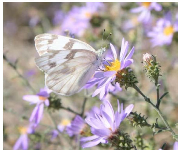
A cabbage white butterfly gathering nectar from a hoary tansyaster flower.

whorled buckwheat ( Eriogonum heracleoides ). The initial evaluations for these species were completed in 2010 and promising accessions were identified for further evaluation. In fall 2010, seed increase fields of Douglas' dustymaiden and hoary tansyaster were installed and a seed increase field of buckwheat will be established in the fall of 2011. These native forbs are important for sage-grouse habitat and pollinators and will be welcome additions for conservation seed mixtures.