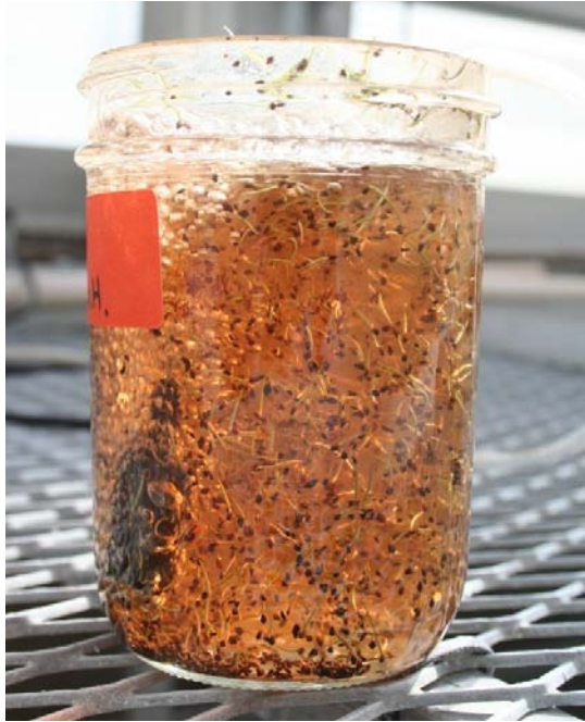
Nebraska sedge seed germinating in an aerated water treatment. Pre-germinated seed can then be used for greenhouse plant production or direct seeded for wetland creation and restoration projects.

economically feasible way to establish wetlands without using greenhouse grown transplants.