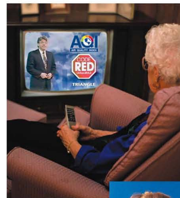
If smoke is affecting your area, check your local media for information on air quality and how to protect your health.

Help keep particle levels inside lower. When smoke levels are high, try to avoid using anything that burns, such as wood fireplaces, gas logs, gas stoves – and even candles! Don't vacuum. That stirs up particles already inside your home. And don't smoke. That puts even more pollution in your lungs, and in the lungs of people around you.