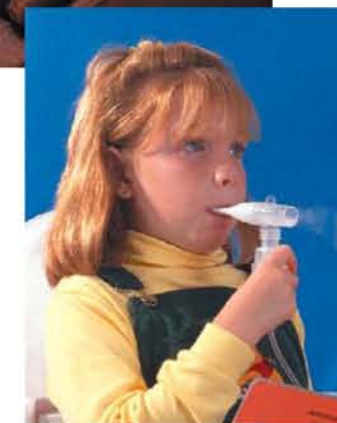
Children with respiratory diseases should be monitored closely during smoke alerts.