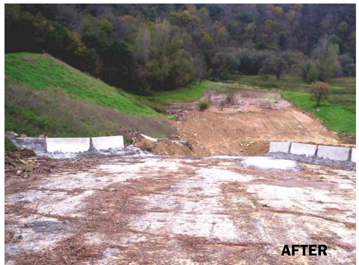
September 2007 during repair. Redirected water to the overfall area.