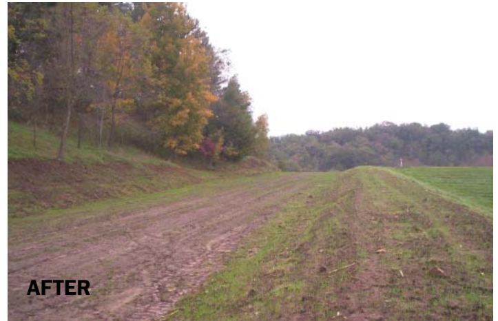
September 2007. Spillway stabilized, regraded and seeded. Looking upstream along spillway.