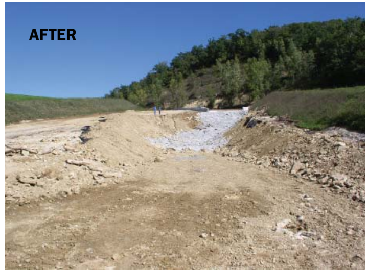
September 2007 during repair. Re-established spillway area and concrete grouted the rock overfall area.