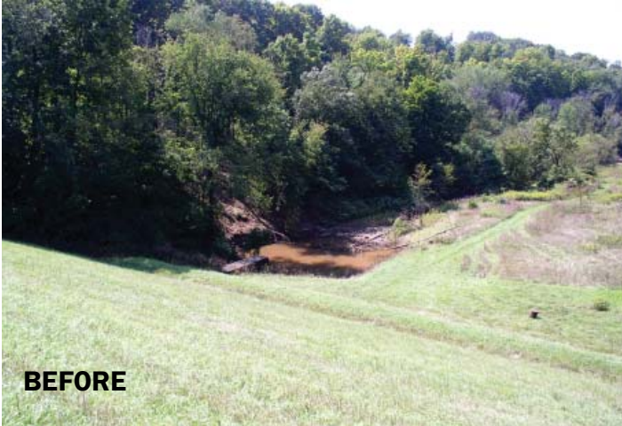
August 2007 during initial assessment.