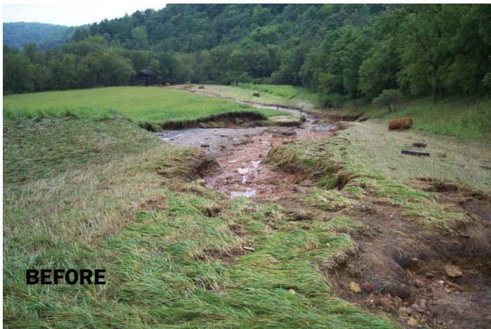
August 2007 during initial assessment.