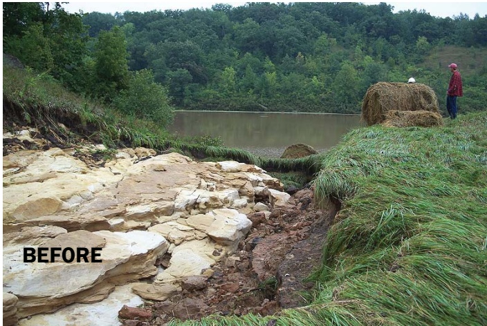
August 2007 during initial assessment.

Future Needs: Seepage through left abutment - needs investigation.