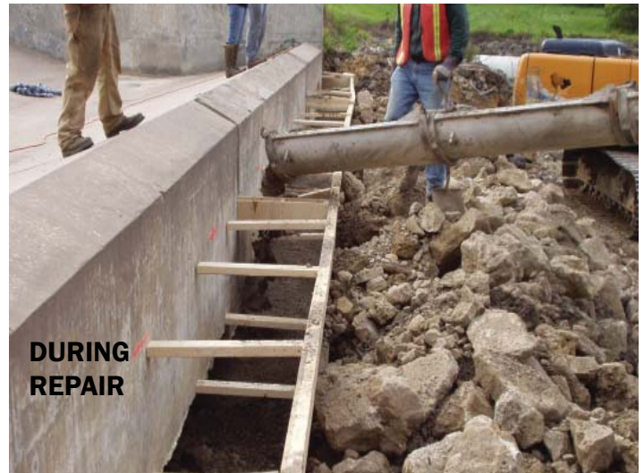
September 2007. Placing flowable fill into void under concrete chute.