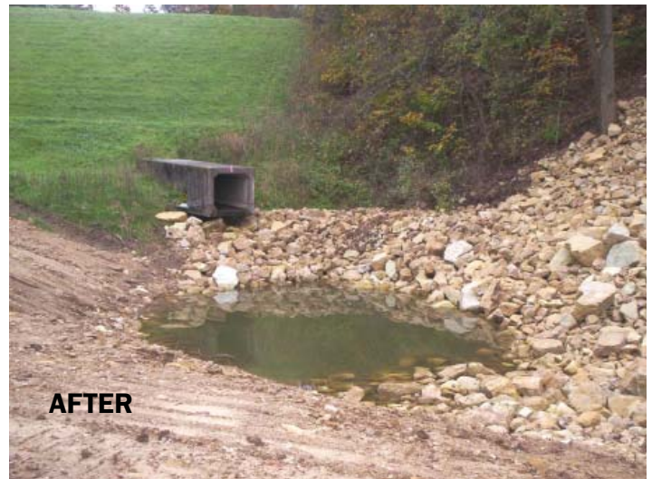
September 2007. Slope stabilized and new riprap added on roadside slope.