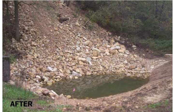
September 2007. Slope stabilized and new riprap added on roadside slope.