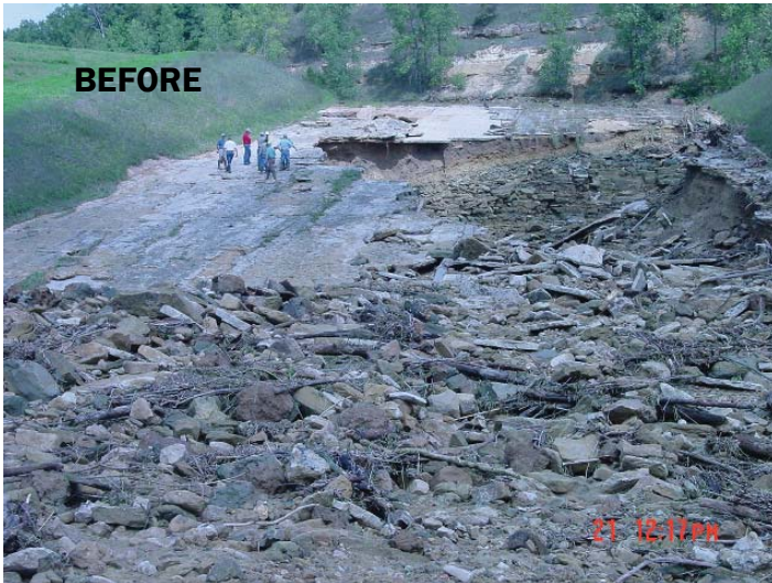
August 2007 during initial assessment.

Future needs: Complete reconstruction of the auxiliary spillway