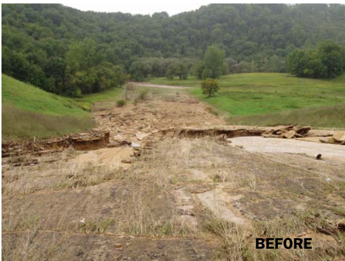
August 2007 during initial assessment.