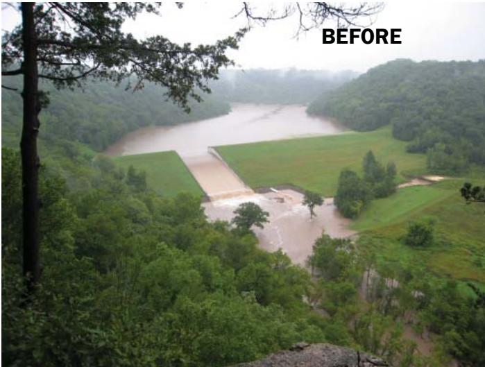
August 2007 during initial assessment.