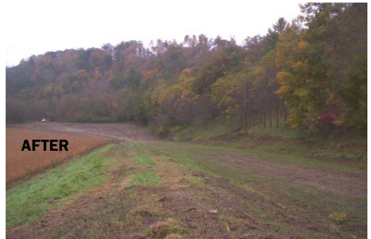
September 2007. Spillway stabilized, regraded and seeded. Looking downstream along spillway.