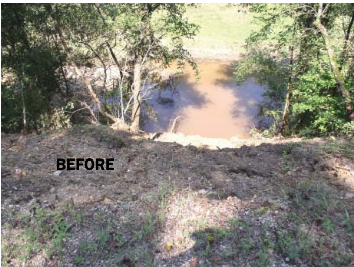
August 2007 during initial assessment.