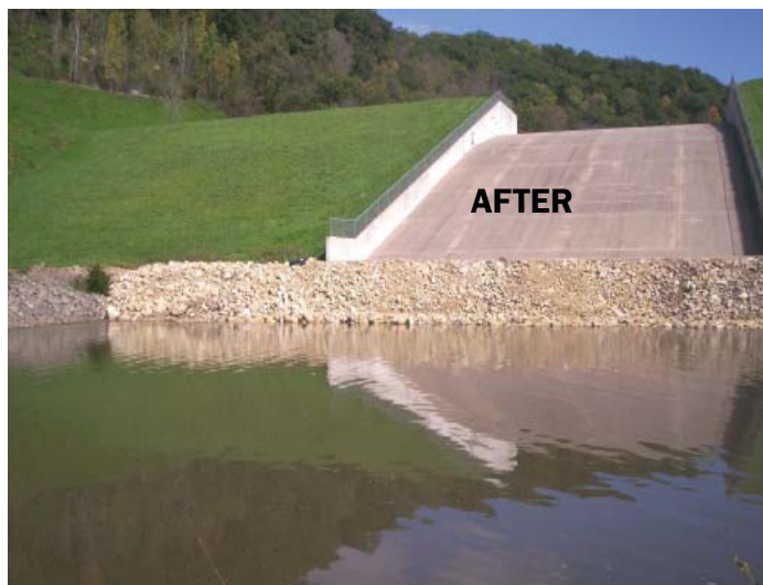
September 2007. Replaced riprap at the bottom of the concrete chute.