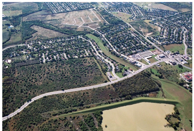
Downstream Development encroaching on Martinez Creek Watershed Site 5 in Bexar County. This dam was rehabilitated in 2005.

Rehabilitation costs are shared 65 percent federal and 35 percent local watershed sponsors.