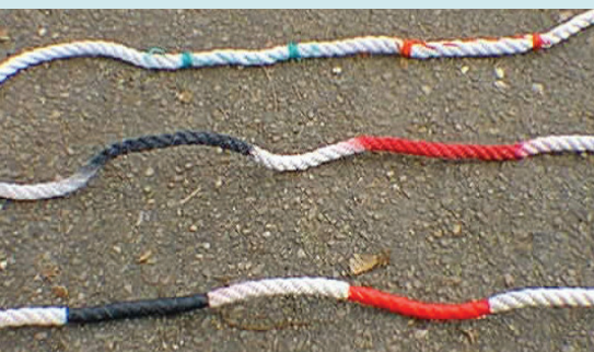
Example of gear markings.

Note: This guide includes only Federal requirements for state and Federal waters; contact your state fishery office for any additional requirements within state waters. Should any regulations overlap with the Plan regulations, the more restrictive regulations apply.