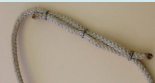
3 hog rings, in a side-by-side configuration, qualifies as a 200 lb. weak link.