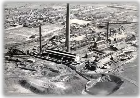
Smelter facilities processed ore on the site for over 80 years.