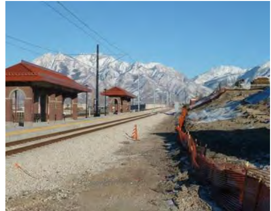
A Utah Transit Authority light rail station opened in 2011 and is another example of mixed-use redevelopment at the site.

EPA was able to satisfy its enforcement priorities while coordinating with the goals and interests of the community, site owners, and other stakeholders so as not to serve as an impediment to the reuse of the site. Enforcement tools such as the 2004 consent decree with Littleton and the Superfund program’s remedial process provided detailed site information to inform redevelopment. By learning lessons from the failure to anticipate long-term stewardship and site redevelopment at the Sharon Steel site, the Midvale Slag site was able to succeed and now serves as a shining example of how EPA’s enforcement tools can play an important role in revitalizing contaminated properties.