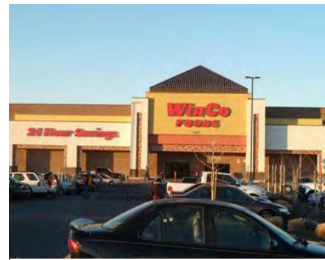
Midvale City rezoned the site with specific redevelopment interests in mind, including commercial retail.

Under the terms of the consent decree, Littleton designed the remedy and cleaned up the site's smelter waste. By conducting the cleanup, Littleton was able to perform the required work at a substantially lower cost than EPA could, and integrated the groundwork for redevelopment as