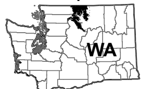
Critical Habitat for Lynx canadensis (Canada Lynx), Unit 4 - North Cascades