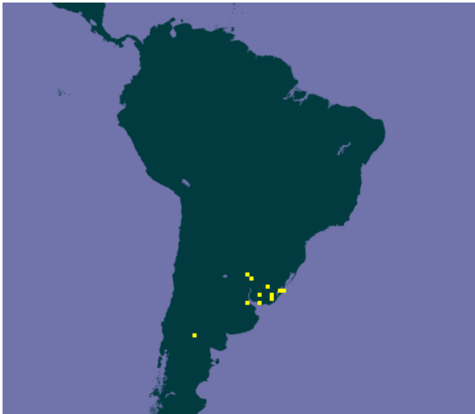
Figure 1. Known global established locations of Odontesthes bonariensis . Map from GBIF (2014).