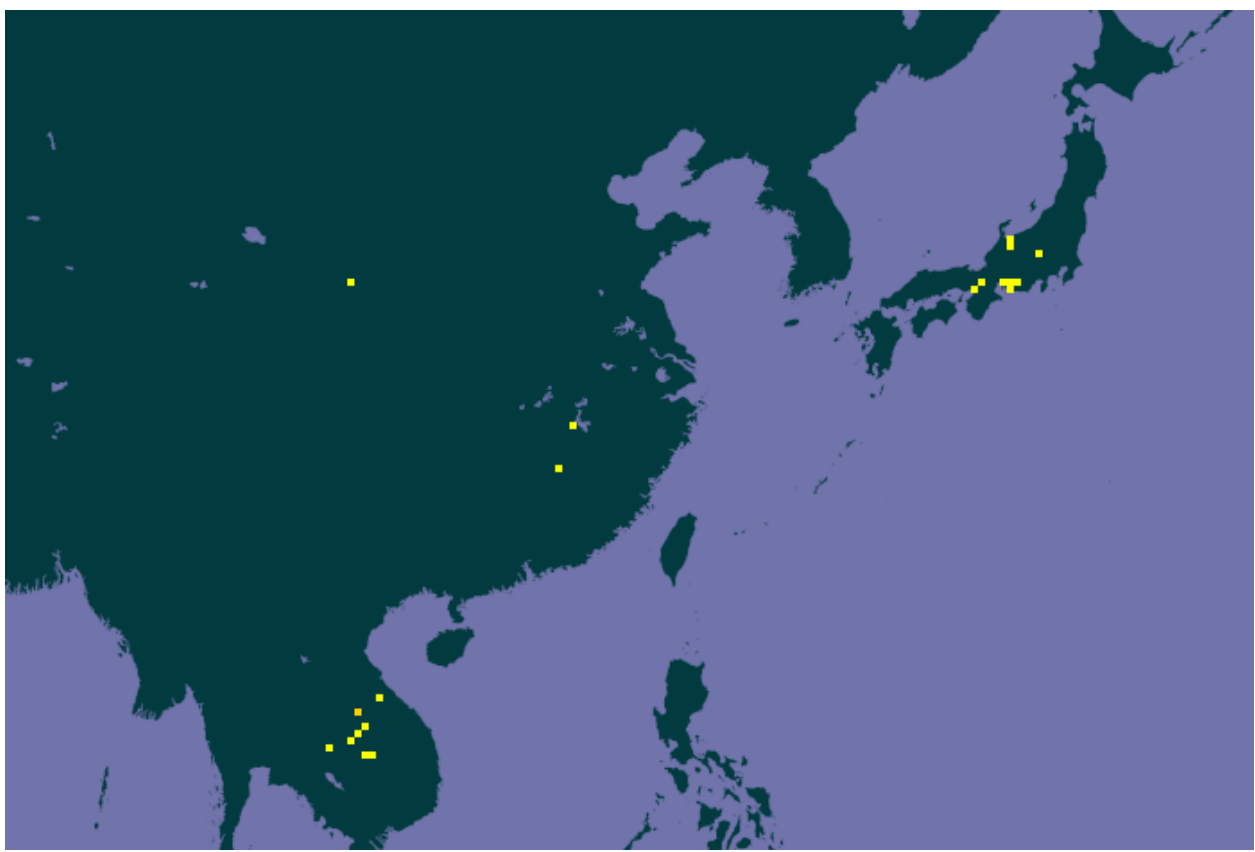
Figure 1. Distribution of Limnoperna fortunei in Asia. Map from GBIF (2014).