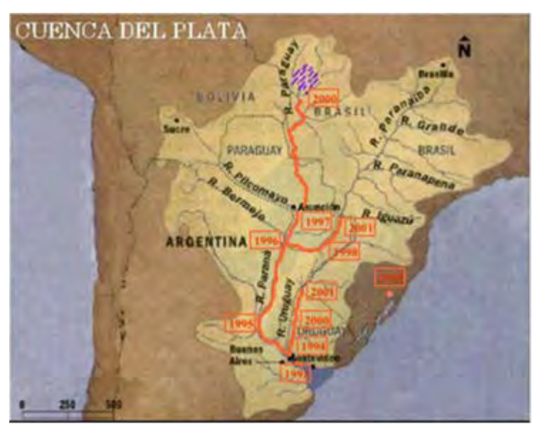
Figure 2. Distribution of Limnoperna fortunei in South America. Map from Crosier et al. (2007).