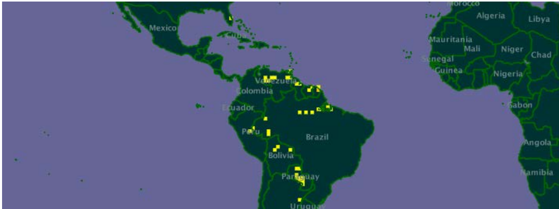
Figure 1. Global distribution of H. littorale . Map from GBIF (2010).