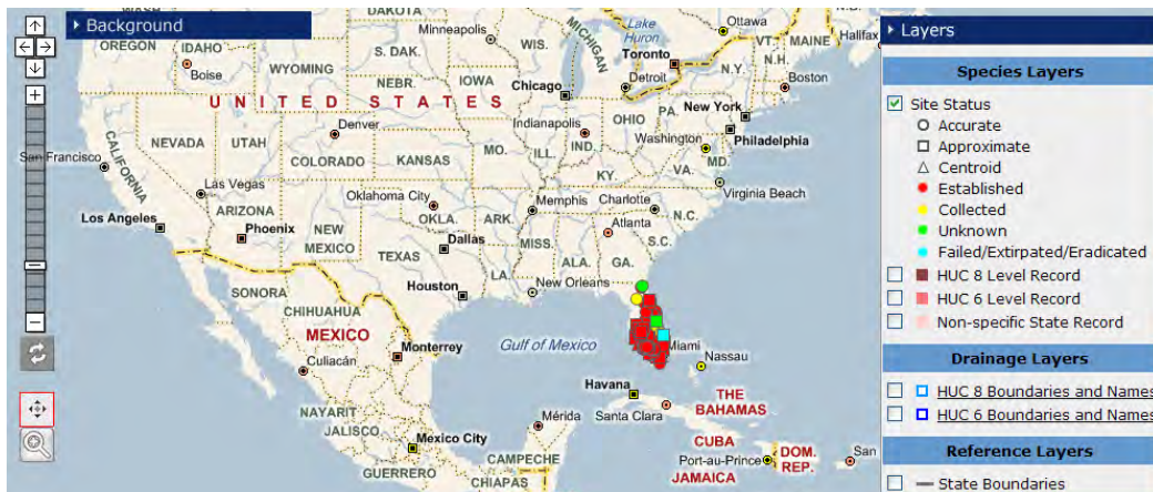
Figure 2. Distribution of H. littorale in the US. Map from Nico et al. (2011).