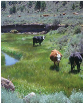
Cattle grazing a small riparian patch within a sagebrush community.

We can conclude that there is no universal riparian herbaceous production response to the complex elements (time, intensity, season, or duration) of grazing management. Consequently, what a manager learns on one site may not be transferable to another site.