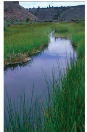
Riparian corridor in eastern Oregon.

Because grazing is such a widespread practice on public and privately owned rangelands, assessment of grazing management practices is a significant part of this review. Platts (1978, 1990) rated the effect of several grazing strategies for stream-riparian habitat values based on his observations and professional