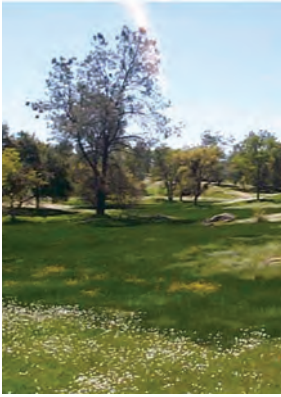
Seasonal riparian corridor in an oak-woodland in California's central Sierra Nevada foothills.