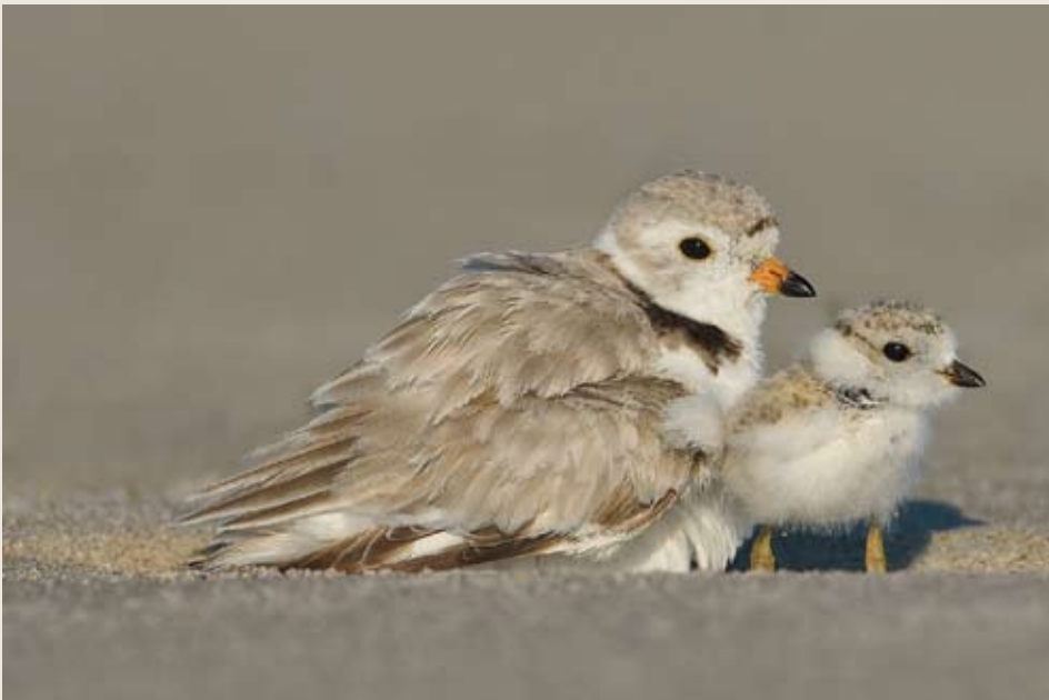
Piping plovers are the beneficiaries of an extensive recovery cooperator network. Federal and state agencies, state municipal beach managers, and non-governmental organizations focus a considerable amount of attention on the research, monitoring, protection, and management of these small shorebirds.

Despite these advances, it's reasonable to ask how much inherent value recovery plans add to the actual recovery process. Some see a tension between the “thinking” and “doing” phases of recovery, contending that planning diverts attention and funding from on-the-ground actions. It's also fair to say, however, that planning is essential for designing effective restoration activities. Recovery plans force us to envision what success looks like and to lay out a clear path for achieving that vision.