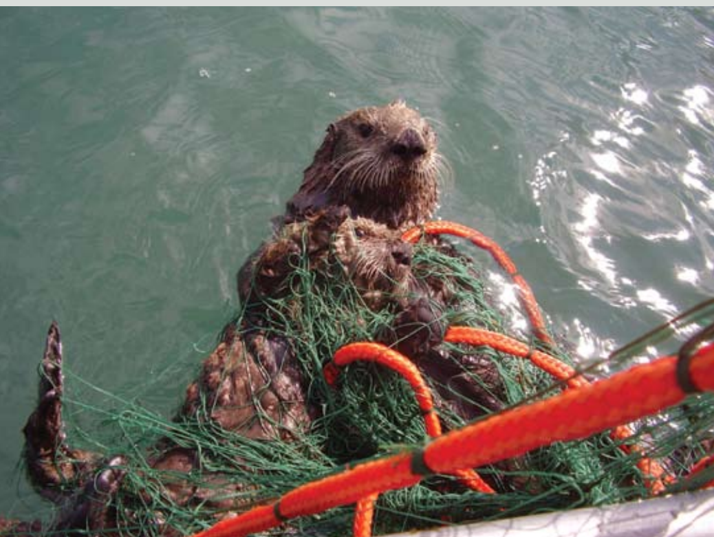
A mother and pup sea otter caught in a research net. Adult sea otters are radio-tagged and tracked for up to two years.