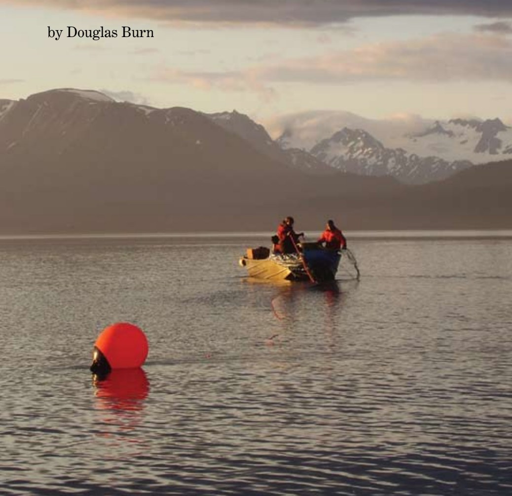
Biologists lay out tangle nets to capture sea otters in Alaska.

Species become endangered or threatened due to one or more factors, commonly referred to as threats. Usually, these threats are primarily human-induced. Threats affecting a species' abundance, range, reproductive capability, and/or their genetic diversity make them more vulnerable to other threats or natural events, such as hurricanes or climate change. Recent recovery plans incorporate an explicit "threats assessment" to identify various