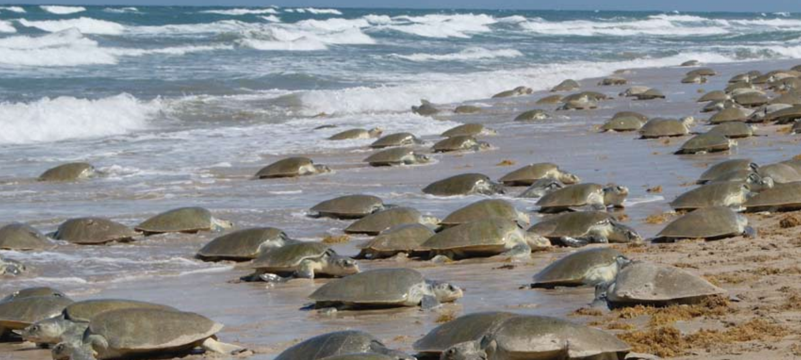
Kemp's ridleys display one of the most unique synchronized nesting habits in the natural world—females will come ashore in large groups and nest.