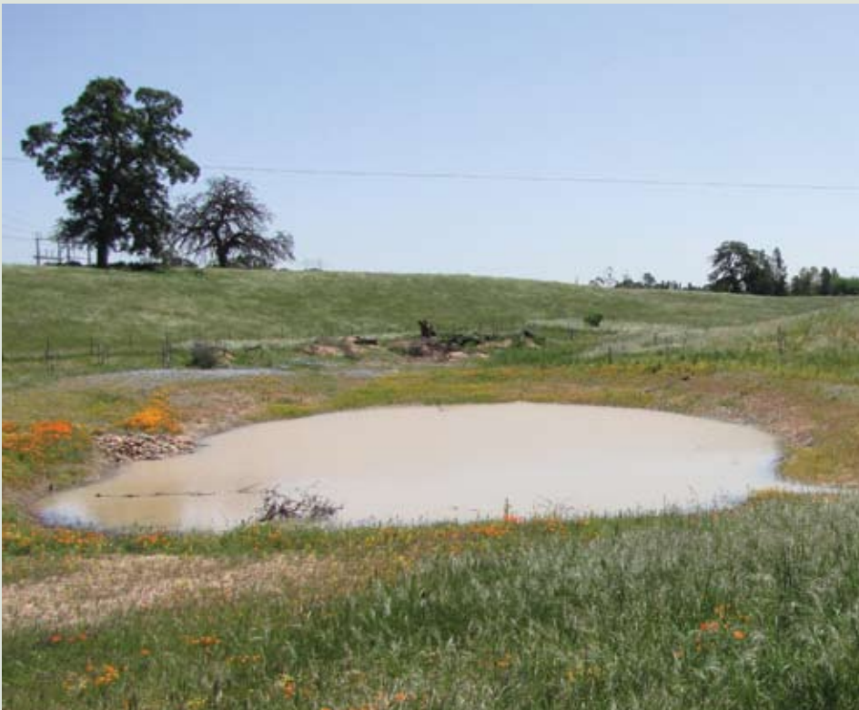
Landowners participating in the Safe Harbor program work to create and conserve suitable breeding habitat for both the California tiger salamander and California red-legged frog.

agreement. Although temporary in nature, many of the conservation measures and management actions that are implemented in a safe harbor agreement come directly from recovery plans for the covered species. These beneficial actions continue for the