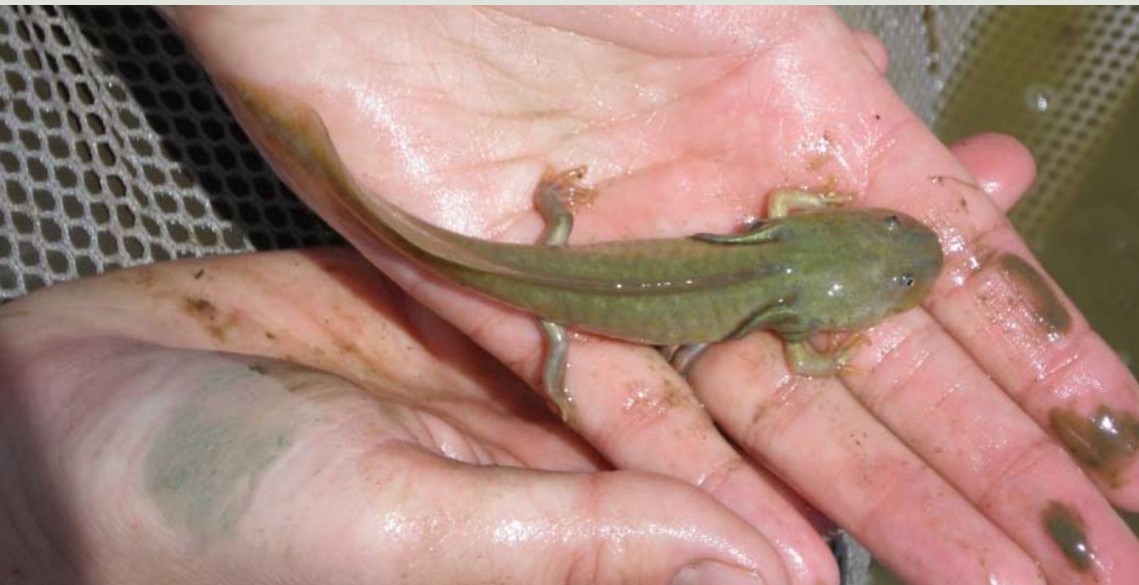
California tiger salamander larvae.

Currently, the Utility District has known occurrences of California tiger salamander on their lands and known occurrences of the California red-legged frog on private lands adjacent to the Utility District’s lands. The Utility District is hopeful that red-legged frogs will disperse to stock ponds on their property and utilize the stock ponds for breeding. However, they also wanted assurances that the listed species on