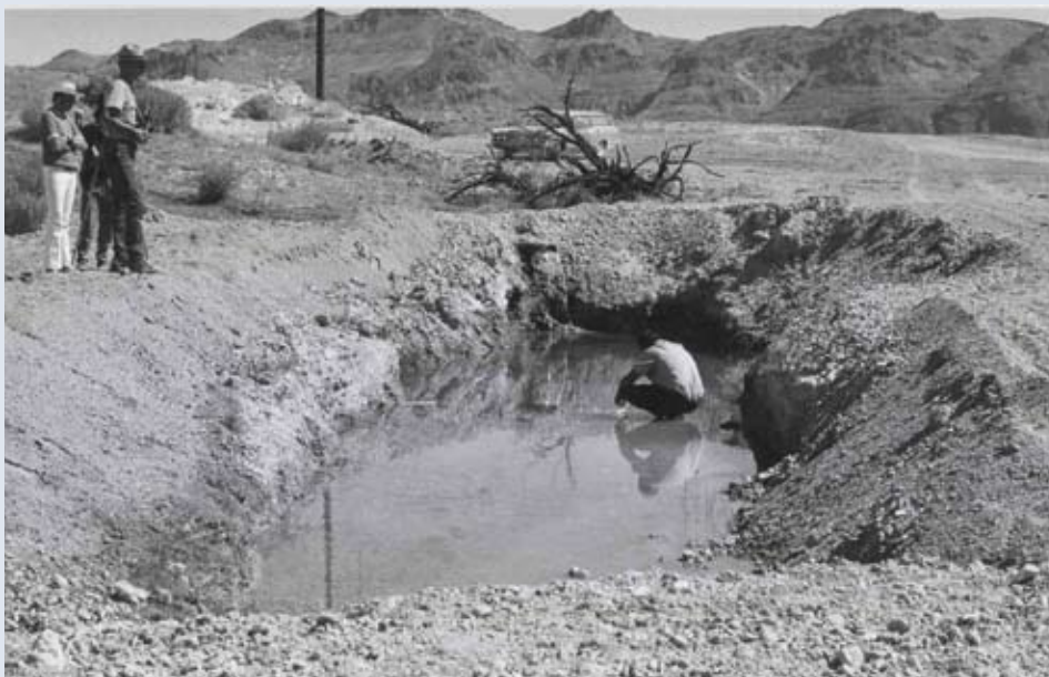
In the 1970s, prior to the establishment of Ash Meadows NWR, the springs located at Point of Rocks and King's Spring were excavated and developed for agricultural use. C. H. Lostetter

Because it is unlikely that invasive species can be eradicated from the ecosystem, the new management approach is to remove as many non-native fish as possible using traditional methods, such as trapping, while restoring habitats to conditions that favor native fish over non-natives. Focusing on the most numerous invasive species, sailfin molly and mosquitofish, biologists began extensive research on historical habitats, restoration processes, and fish behavior. Among the habitat characteristics they studied were water depth, velocity, and temperature at various sites in the system. The findings guided managers in choosing the designs for habitat restoration.