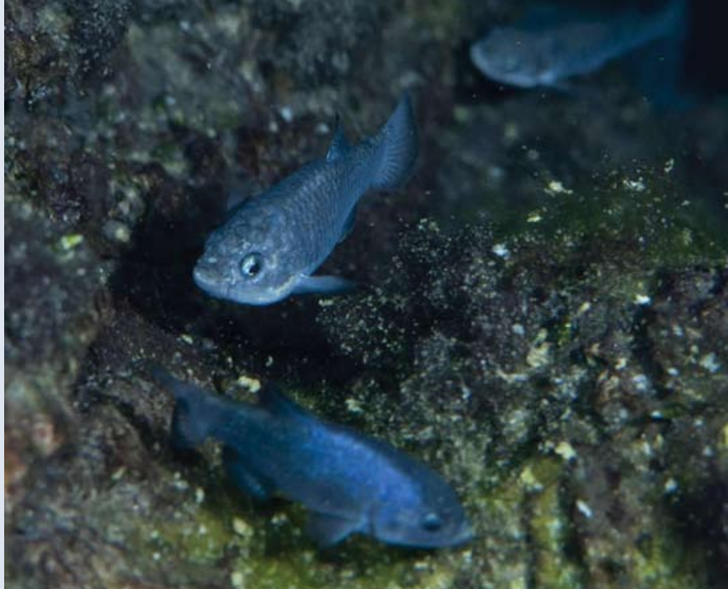
The Devils Hole pupfish is a truly unique species, with one of the smallest ranges of any vertebrate. This inch-long, iridescent blue fish makes its home in the 93 degree waters of Devils Hole, which is located within Ash Meadows National Wildlife Refuge. Olin Feuerbacher

The successful reestablishment of speckled dace into the Fairbanks system would not have been possible without numerous volunteers and partners. Funding was obtained by