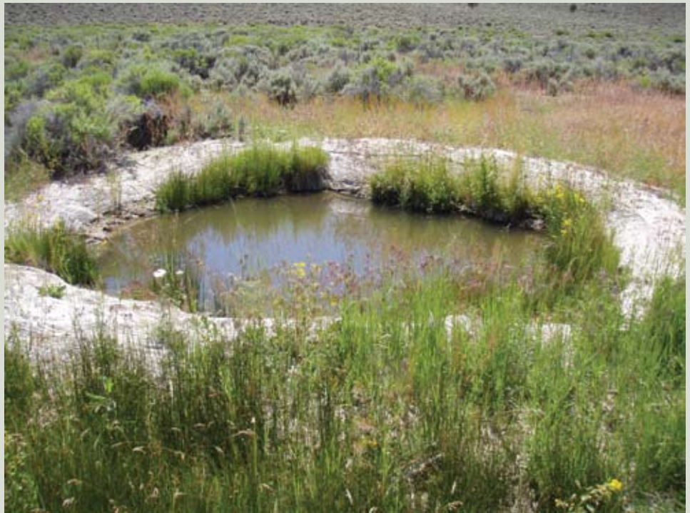
One of the two spring-fed ponds constructed at Dace Springs in 2009.

In 2009, the Service completed a 5-year status review for the Foskett Spring speckled dace. Among the recommendations in the review was the collection of demographic information on age structure, age at reproduction, and longevity. In partnership with Oregon State University, ODFW initiated a project in 2010 to gather this information. Validation is the first step in assessing the age structure of a population. In this case, validation