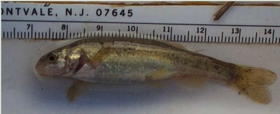
Foscett speckled dace ( Rhinichthys osculus ssp.).

The Foscett Spring speckled dace ( Rhinichthys osculus ssp.) is a small fish known from a single population inhabiting Foscett Spring in south-central Oregon. In 1985, it was listed under the Endangered Species Act as threatened, due to habitat loss and its restricted distribution.