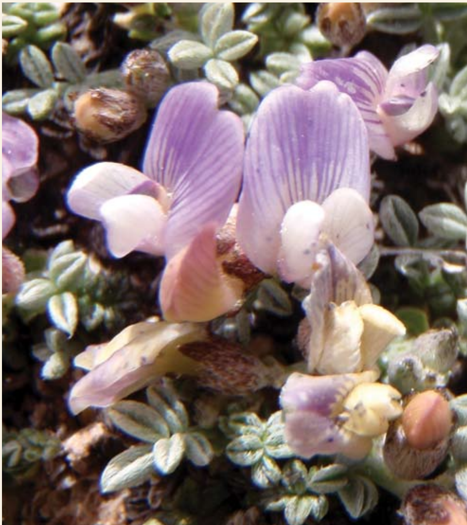
Sentry milk-vetch in bloom.