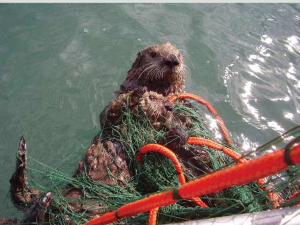
A mother and pup sea otter caught in a research net. Adult sea otters are radio-tagged and tracked for up to two years.