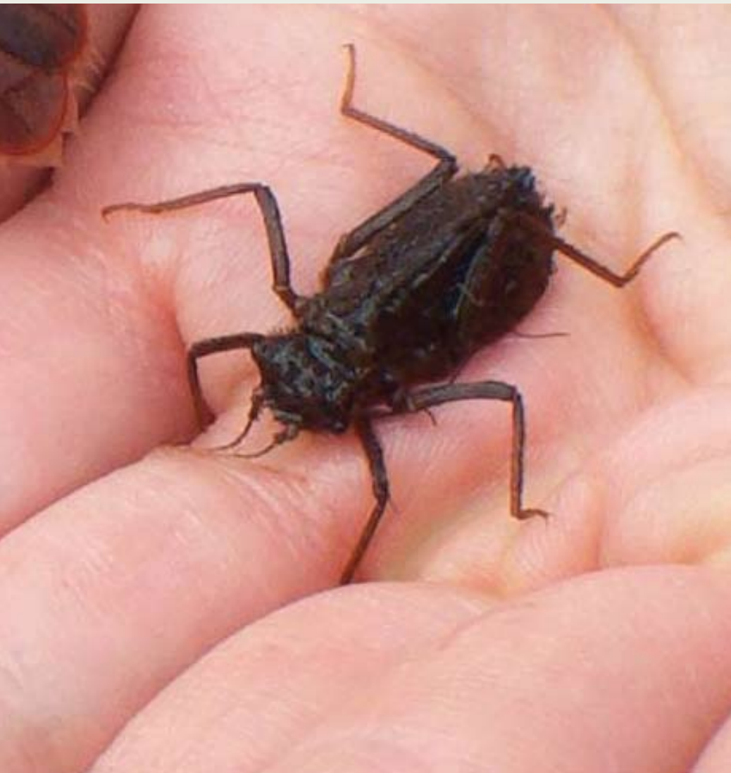
Hine's emerald dragonfly larvae.

conservation actions are needed, where they are best applied, and how many resources will be required to achieve recovery objectives. The Service calls its new approach to addressing these challenges Strategic Habitat Conservation (SHC).