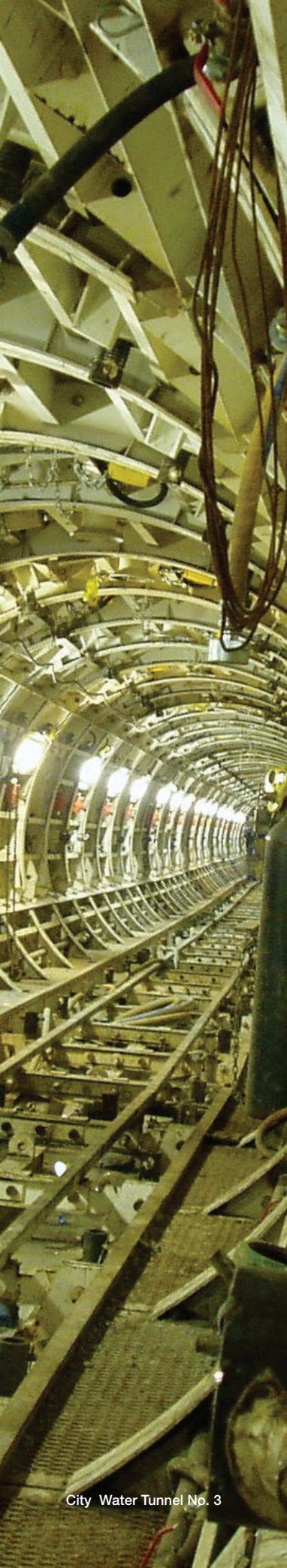
City Water Tunnel No. 3