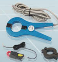
Split Core CT