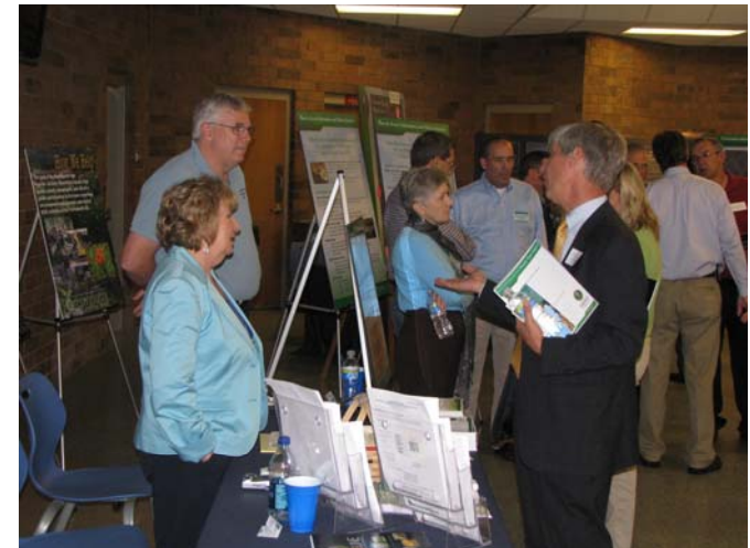
Attendees talk with DOE, contractor and SSAB representatives at DOE public information session held May 28, 2009, at the Vern Riffe Career Technology Center, Piketon.