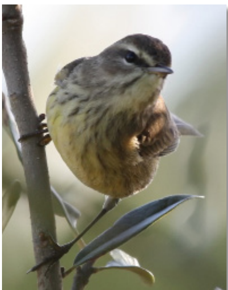
Palm Warbler.

Applicants submit project proposals to the U.S. Fish and Wildlife Service's Division of Bird Habitat Conservation. Eligible proposals are presented to the North American Wetlands Conservation Council. The Council, which has been delegated final approval authority by the Migratory Bird Conservation Commission, then selects the slate of projects to be funded and informs the Commission of its decision. The Division of Bird Habitat Conservation awards and administers the approved grant projects.