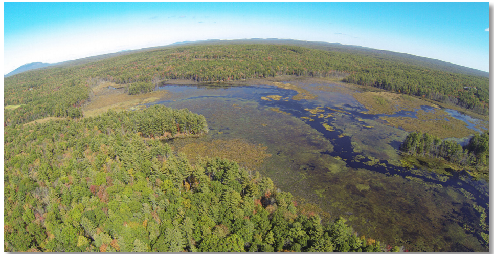
A NAWCA small grant will protect the Eagle Reserve in Massachusetts.