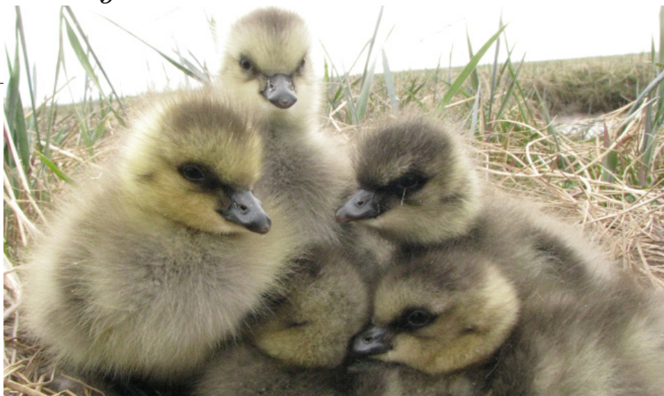
The North American Wetlands Conservation Act protects nesting habitat for waterfowl like these Cackling Goose goslings.

The U.S. Small Grants program encourages grantees new to NAWCA and current partners to carry out smaller-scale, long-term wetlands conservation projects that may not