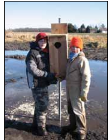
Middle school class installing Wood Duck boxes that they've built.