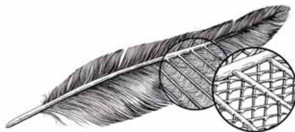
Laura Maloney, DJ Case & Associates

Birds are warm-blooded vertebrates. They have three characteristics that distinguish them from other animals: feathers, hard-shelled eggs, and hollow bones. Waterfowl can be distinguished from other birds by their characteristics that maximize the ability to survive in a wet environment. For example, waterfowl have a specialized feather structure (including waterproof external feathers), a body shape designed for swimming, feet and foot webbing that is distinctive as compared to other water birds, unique positioning of feet and legs on the body in a way that is adapted to food gathering and other life activities, shapes of the bill that are adapted to food gathering and eating, and characteristics pertaining to the way they fly. Understanding how waterfowl are adapted to their environment helps people protect or manage the special habitats waterfowl need to thrive.