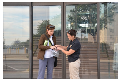
U.S. Fish and Wildlife Service Urban Bird Treaty Coordinator collects birds in DC for the DC Lights Out program.

Migration exposes birds to many natural hazards, but the degree of human-caused mortality incurred at artificial objects or by human-introduced contaminants or from non-native predators has a devastating cumulative impact on populations of migratory birds.