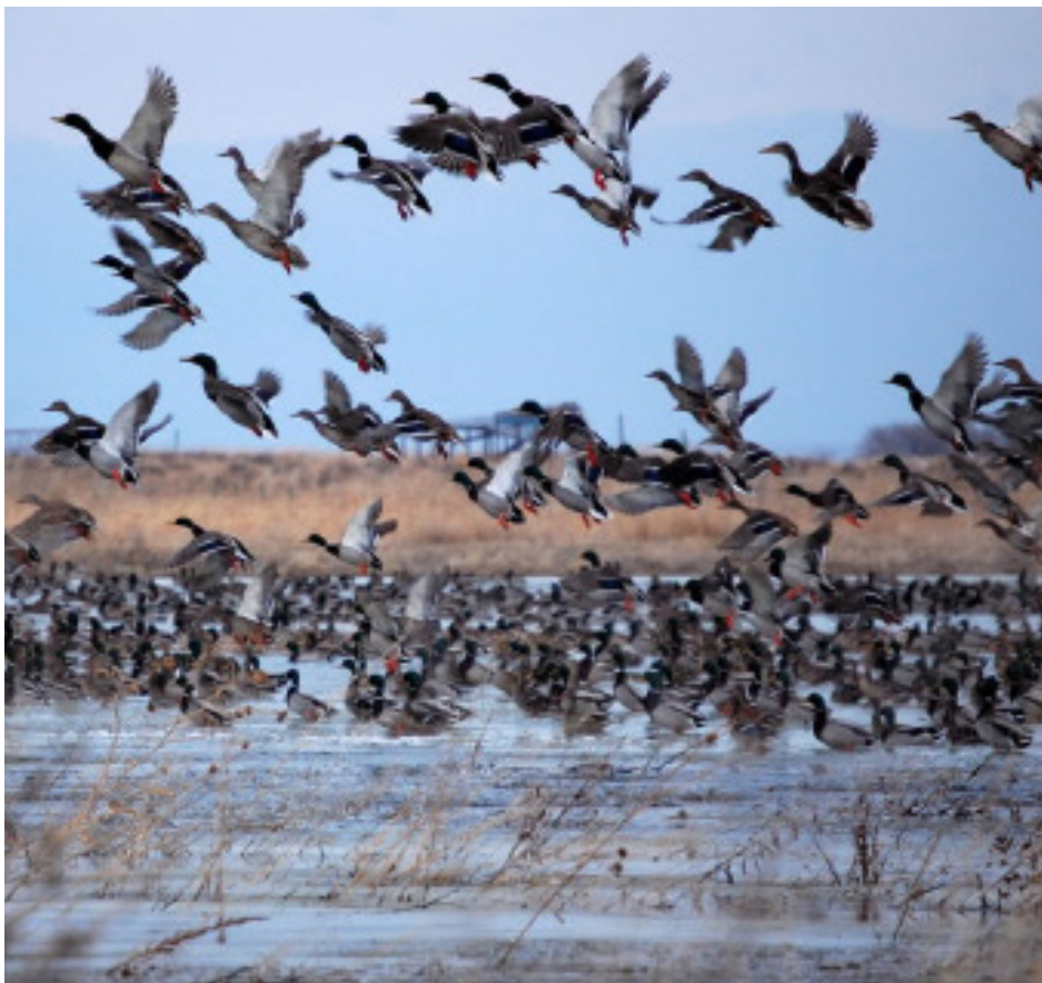
Mallard flock.