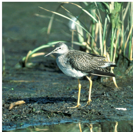
Lesser Yellowlegs.

Steering Committee, which forwards eligible proposals to the appropriate Joint Venture Management Board, the Secretariat to the NABCI/NAWCC Canada Council, and finally the Canada Council for review and endorsement. Projects are presented to the North American Wetlands Conservation Council in the United States, which reviews and recommends them to the Migratory Bird Conservation Commission for final funding approval. The U.S. Fish and Wildlife Service's Division of Bird Habitat Conservation awards and administers the approved grant projects.