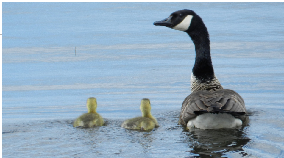
Canada Goose with goslings.

activities such as stewardship, evaluation, and communications;