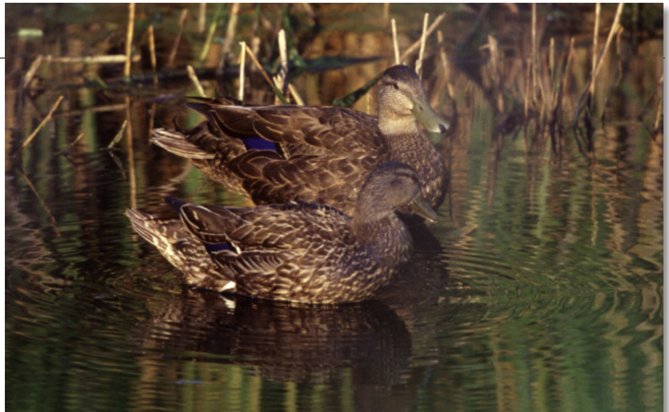
American black ducks.