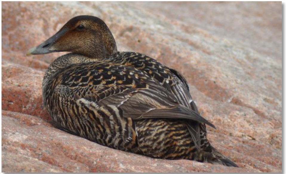
The Common Eider is a NAWCA high priority waterfowl species.