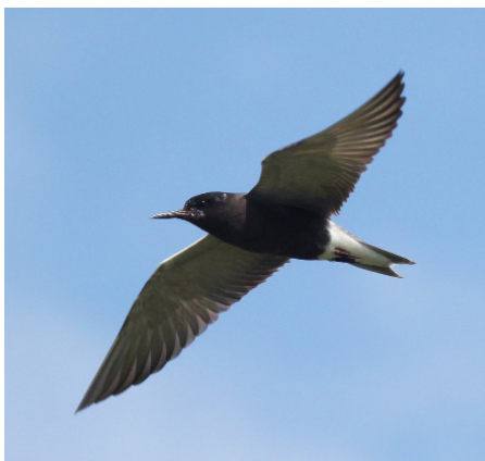
Black Tern.