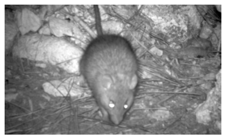
Rat photographed by an automatic camera at the entrance of the petrel nest discovered by members of Grupo Jaragua in 2010.

Mongoose, pigs and dogs are implicated in the extirpation of the Jamaican Petrel ( Pterdroma caribbaea ; Douglas 2000). These species appear to be rare at known Black-capped Petrel breeding locations (Wingate 1964, J. Goetz, unpublished data). However, they are all able predators of adults and thus even at low densities could have a large impact on breeding petrel populations.