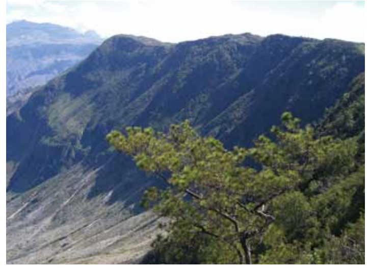
Petrel nesting habitat in the steep forested escarpment of La Visite, Haiti. Photo: J. Goetz, 2008.

Detailed natural history information on the Black-capped Petrel is sparse due to the bird's rarity, pelagic foraging habits, and to the remoteness of its breeding locations. Lee (2000) provides a review of the species. It feeds primarily on squid, small fish, and fauna associates of Sargassum found in deep waters along current edges, eddies within the Gulf Stream and at sites of upwellings. Foraging is primarily at night, and done