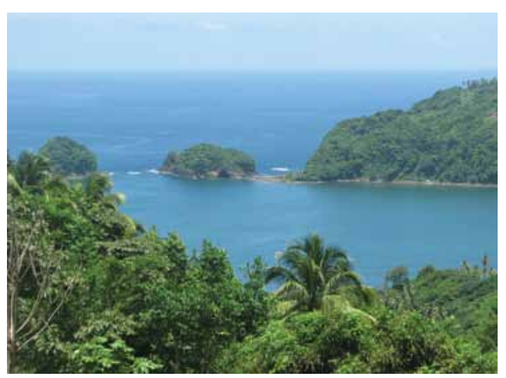
Domenica may still harbor a breeding population of Black-capped Petrels.

Collier et al. (2003) conducted call-playback searches on Morne Fou, part of the Petit Coulibri Estate, in January 2002, but found no petrels. However, they spoke with a fisherman who heard vocalizations while fishing at night below Morne Fou, and with two other individuals who reported seeing a petrel in the mountains of the Grand Bay area. In May 2007, an adult female Black-capped Petrel with a clear brood patch