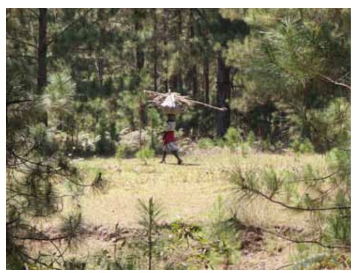
Collecting firewood at La Visite. Photo: J. Goetz, 2009.

Black-capped Petrels face numerous known threats on land and at sea, although additional research is needed to fully understand their impact. At breeding locations, threats include loss and degradation of forest habitat, predation by introduced mammalian predators, harvest by local people, collisions with communication towers, and climate change effects. Potential and emerging threats at sea include impacts from fisheries by-catch, collisions with wind farm structures and oil platforms, oil spills affecting foraging areas and climate change effects. Threats at sea are discussed further in the