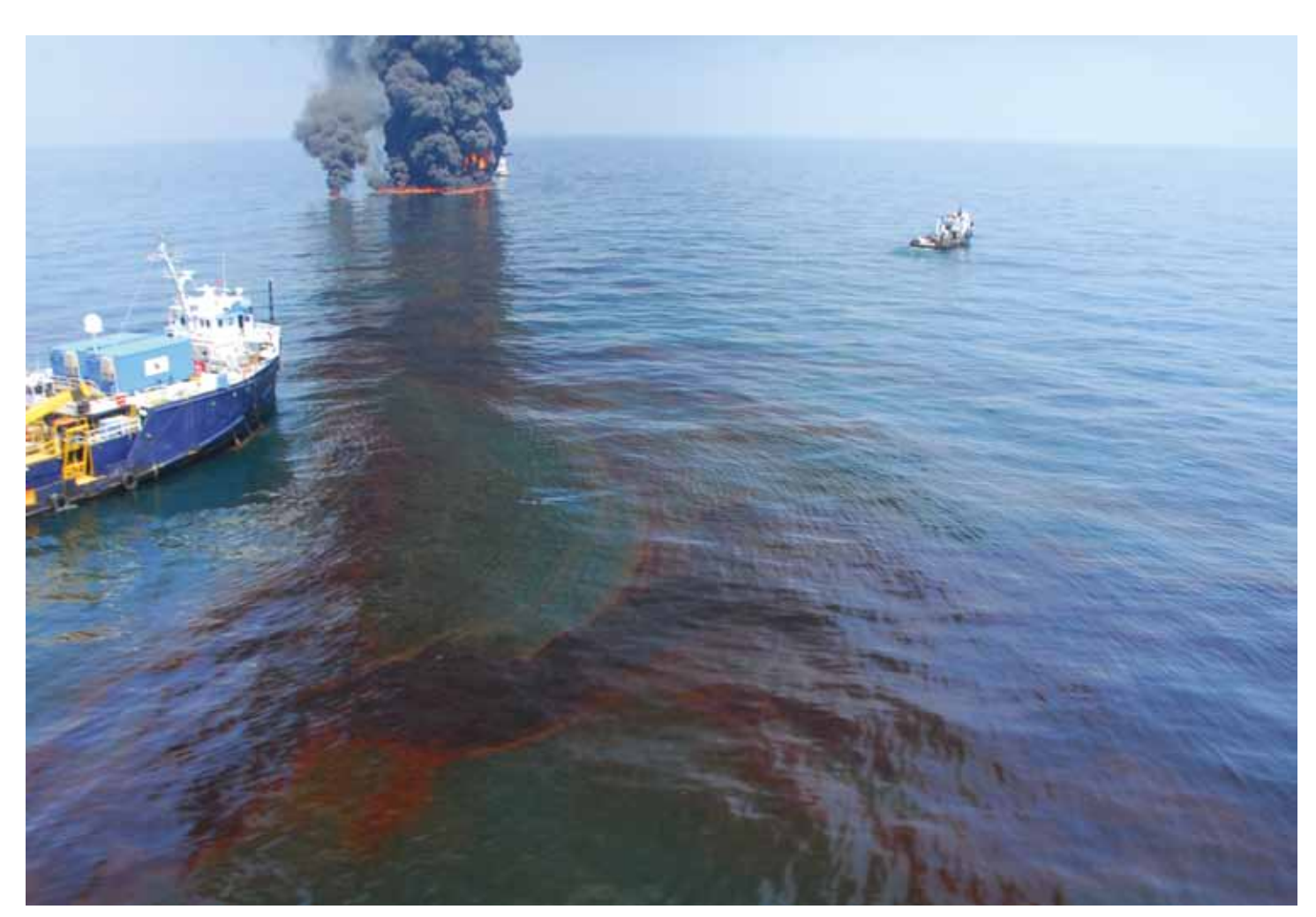
The Premiere Explorer of Venice, La. stands by near a controlled burn of spilled oil from in the Deepwater Horizon/BP oil spill in the Gulf of Mexico.

Predictions for climate change at the global and especially regional levels are highly uncertain. The Gulf Stream and its associated water masses in the western North Atlantic form a key foraging area for the Black-capped Petrel, and effects in that system (e.g., stoppage or reversal) would likely significantly impact the species.