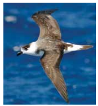
Typical Black-capped Petrel, photographed in North Carolina.

habitat. Although the most recent records of breeding populations on these islands are from in the mid- to late-1800s, sporadic observations continued throughout the early 1900s. However, it was unclear where breeding populations might persist (Lee 2000 and references therein) until in 1963, David Wingate (1964) discovered breeding Blackcapped Petrels in southeastern Haiti on Massif de la Selle.