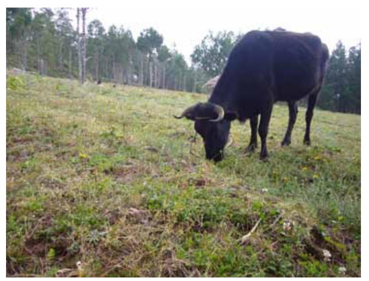
Forest converted to pasture at La Visite. Photo: J. Goetz, 2009.