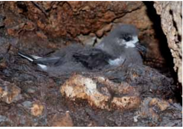
One of the first-ever photos of a Black-capped Petrel chick. Photo: J. Goetz, 2011

more importantly, this discovery gives petrel conservationists clear grounds for excitement and optimism. It demonstrates that despite the petrel's precarious global conservation status, and despite Haiti's lamentable human development and environmental situation, this rare species persists, and apparently can even nest successfully in areas that were not considered suitable habitat due to clear threats from nearby human settlements and invasive predators.