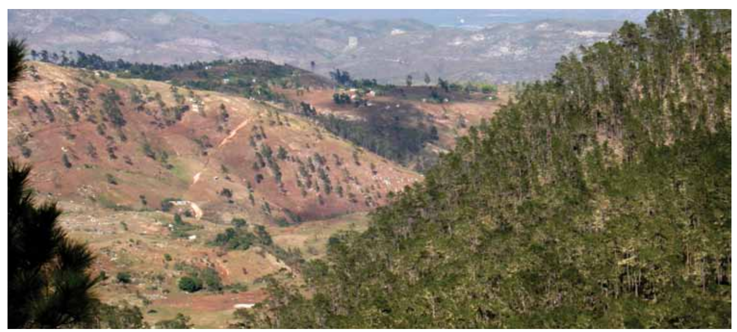
Clearing for agriculture along the border between Haiti and the Dominican Republic (foreground), near Loma del Toro.

they estimated to contain dozens of birds. They captured two birds in mist nets and two birds that landed on the ground, possibly attracted by the light of a headlamp. The 20 km escarpment from the easternmost point that Goetz surveyed in 2009 to Pic La Selle (N 18.360°, W 71.975°) has not been surveyed.