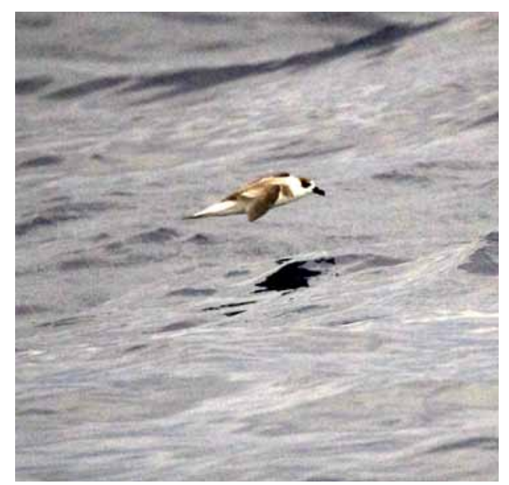
Black-capped Petrel at sea.

The excitement of the recent discovery of the Black-capped Petrel nest and documentation of the chick's development is tempered by the knowledge of imminent threats to the survival of the species. The forested nest site that was discovered is threatened by agricultural expansion. Chicks and adults at this site are vulnerable to invasive mammal predators and to direct harvest by local residents – threats that exist in varying degrees at all known breeding locations. Meanwhile, marine pollution and impacts from fisheries and industry threaten Black-capped Petrels while they forage at sea. As a result of these threats, and its small, fragmented population,