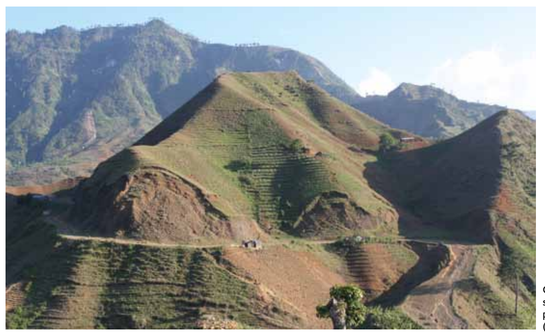
Clearing for agriculture along steep slopes (foreground) near the known petrel nesting habitat of La Visite (background).

The conservation future for petrels will be more secure if there are robust regional populations at more than the three currently confirmed locations, and if petrels are more broadly distributed across their historical range. Confirming presence of petrels at additional historical, and yet unconfirmed locations is thus also a high near-term priority, because existence of additional sites beyond the three confirmed locations on Hispaniola may affect conservation action priorities.