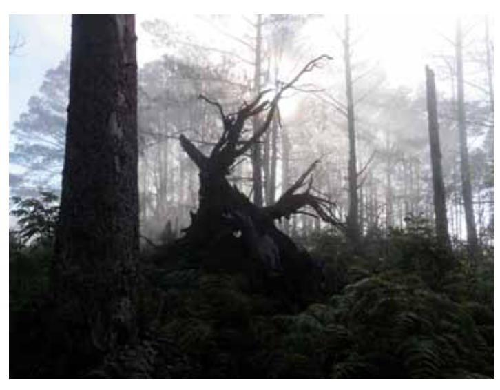
Since 2006, several escaped agricultural fires have burned to the top of Pic Macaya, killing many of the towering pines on the summit. Strong natural regrowth is underway, but the forest needs protection from wildfires to mature.

Account for At-Sea Range. Overall the most pressing threats to the Black-capped Petrel appear to be at breeding locations. The primary threats are deforestation to expand agriculture and, very likely, predation by invasive mammals. The nature and extent of these threats are different at each breeding location. This section describes the nature of each threat in detail; particular features and the extent of each threat are given in range state accounts.