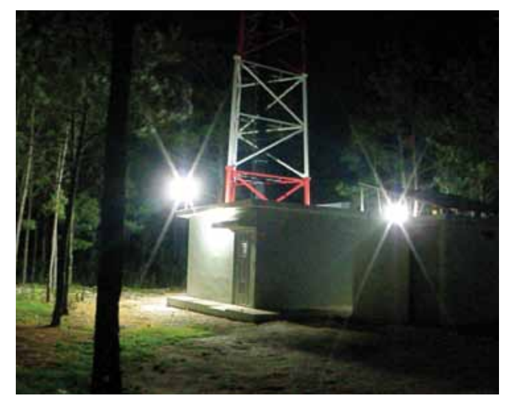
This brightly-lit cell phone tower is within 30 m from the cliff where petrels breed at Loma del Toro, Dominican Republic. The lights are likely to attract petrels to this tower, and two nearby guyed towers, creating a fatal threat to breeding petrels at this site.

Most of the known or potential breeding locations for the species have been designated as Important Bird Areas (IBAs; Birdlife International 2008). In the case of the known breeding locations near the Haitian-Dominican border and potential location in Cuba, the presence of Black-capped Petrels