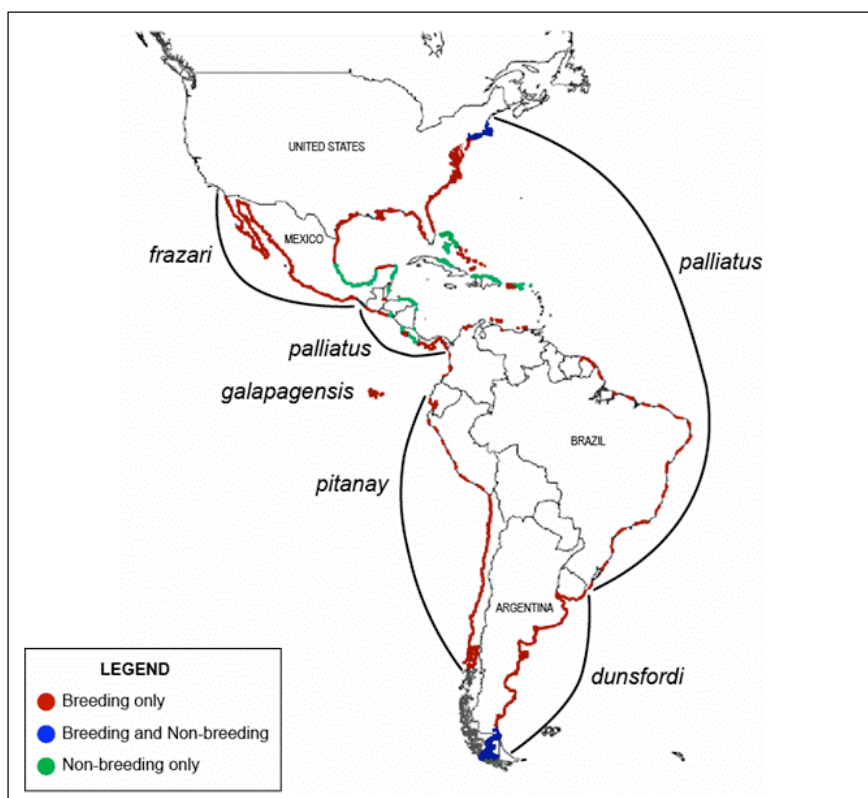
Figure 1: The range of the American Oystercatcher, Haematopus palliatus .