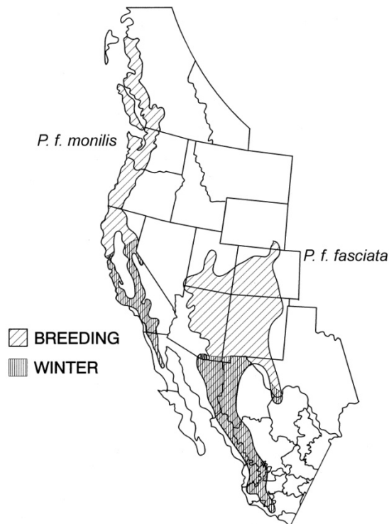
Figure 1. Distribution of Pacific Coast ( P. f. monilis ) and Interior ( P. f. fasciata ) band-tailed pigeons in North America (after Braun et al. 1975).