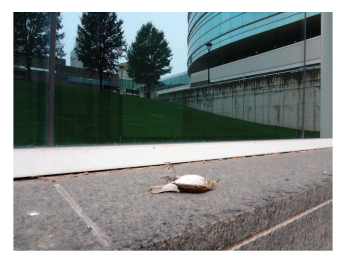
FIGURE 1. A Swainson's Thrush killed by colliding with the window of a low-rise office building on the Cleveland State University campus in downtown Cleveland, Ohio.

Research on bird-building collisions typically occurs at individual sites with little synthesis of data across studies. Conclusions about correlates of mortality and the total magnitude of mortality caused by collisions are therefore spatially limited. Within studies, mortality rates have been found to increase with the percentage and surface area of buildings covered by glass (Collins and Horn 2008, Hager et al. 2008, 2013, Klem et al. 2009, Borden et al. 2010), the presence and height of vegetation (Klem et al. 2009, Borden et al. 2010), and the amount of light emitted from