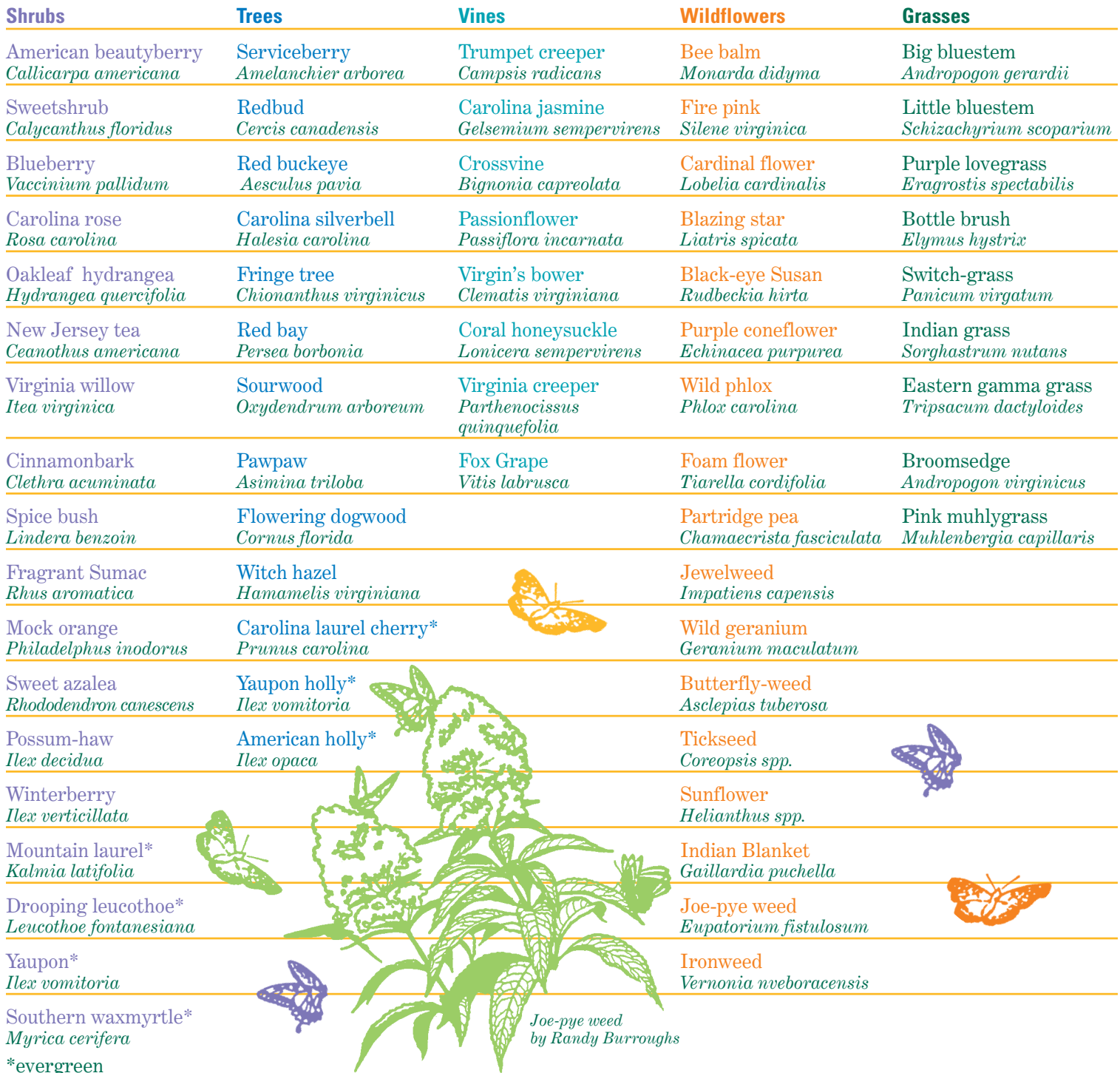
Joe-pye weed by Randy Burroughs

The plants listed are appealing to many species of wildlife and will look attractive in your yard. To maximize your success with these plants, match the right plants with the right site conditions (soil, pH, sun, and moisture). Check out the resources on the back of this factsheet for assistance or contact your local extension office for soil testing and more information about these plants.