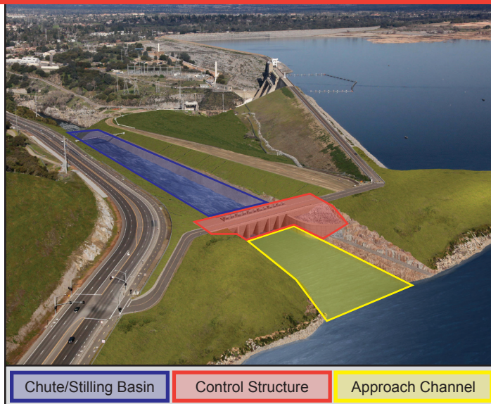
Chute/Stilling Basin Control Structure Approach Channel

The dam raise project will primarily raise multiple dikes at the facility by as much as 3.5 feet in addition to other upgrades.