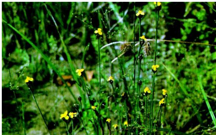
Tennessee yellow eyed grass

U.S. Fish and Wildlife Service Southeast Region Alabama Ecological Services Field Office Daphne, Alabama